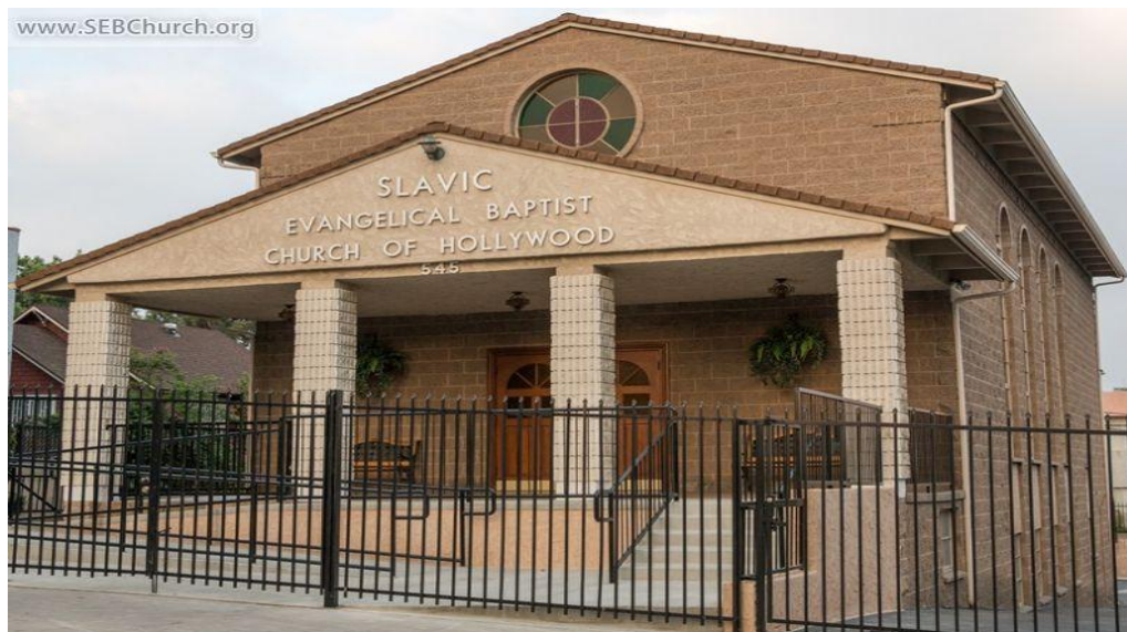
The picture was obtained with consent of Hollywood Church from www.sebchurch.org