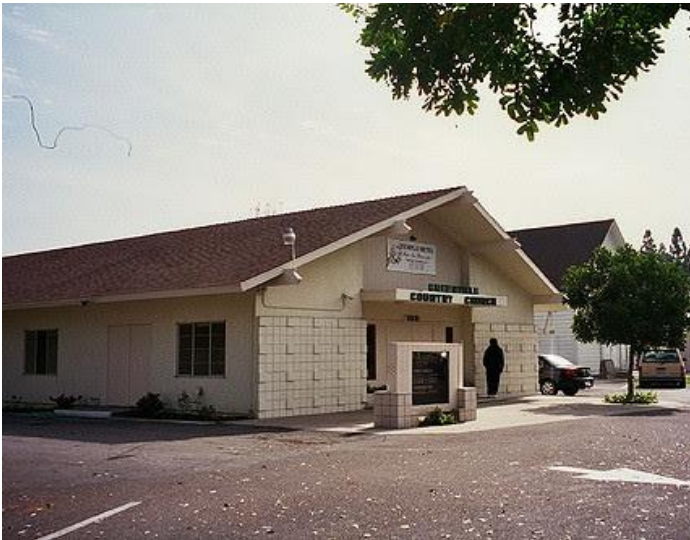
Greenville Country Church

A rental agreement of a building adjacent to the main church was reached with the leaders of “Greenville Country Church” at 3501 South Greenville Street, Santa Ana, CA 92704.