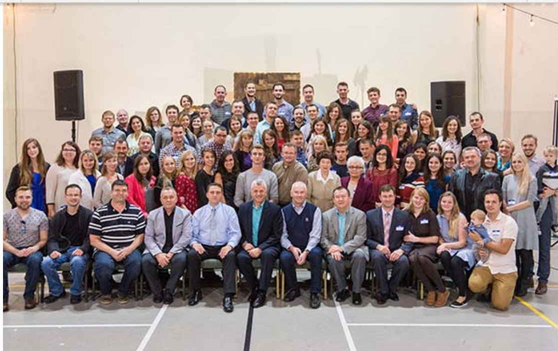
Participants of missionary meeting