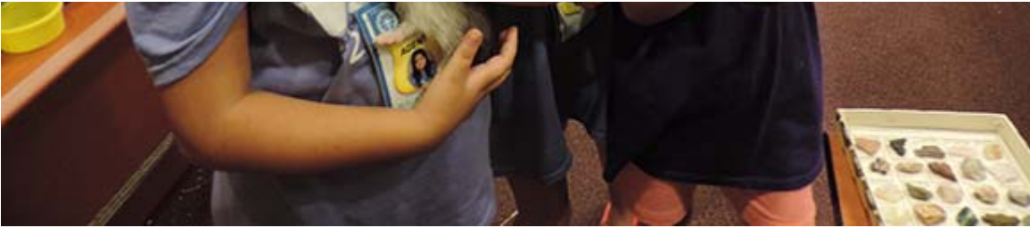
In the Camp