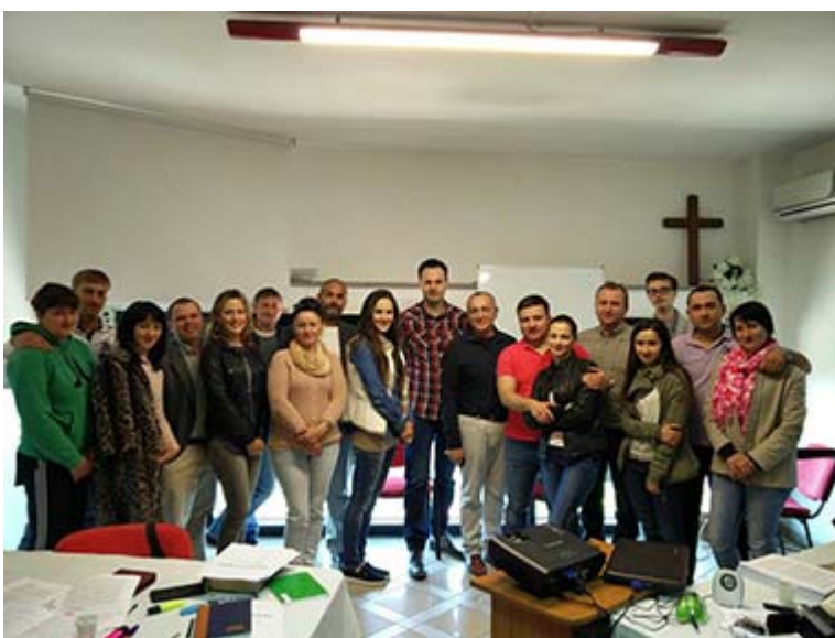
The Students and Teachers

Please pray for this program and its students.