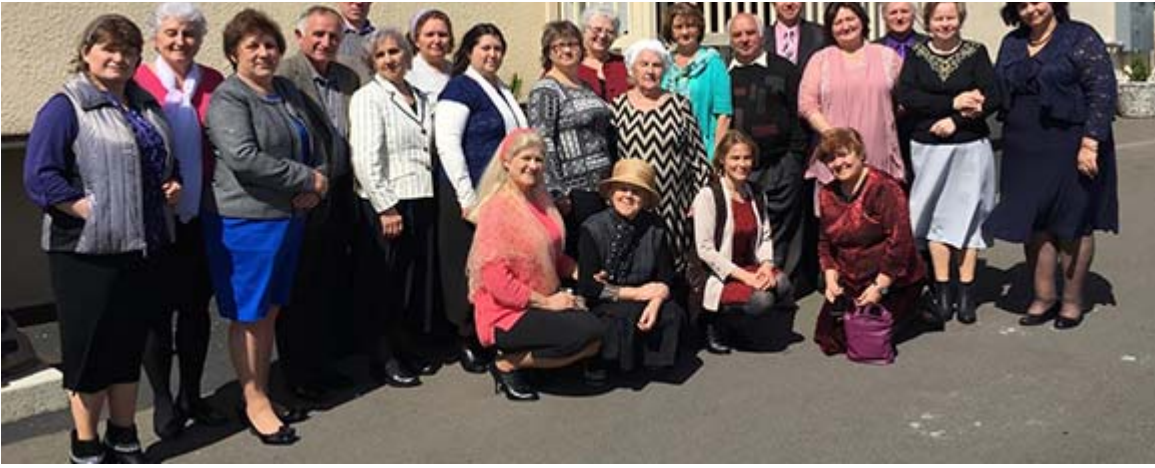
After the Women Conference