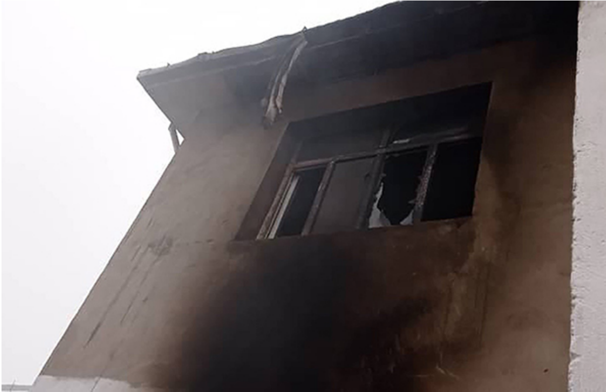
This is what the Center of Hope looks like now.

The Mission is asking for help at the time of this distress, and for any financial help possible. The address to send donations, can be found in the same article – click this link.