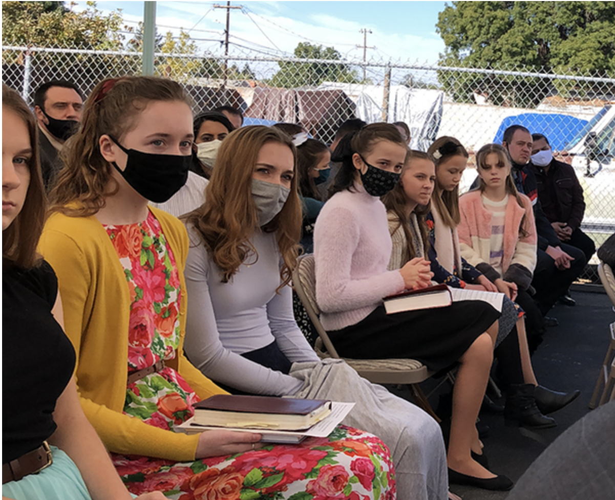
Church service at the church in Hayward at the time of the pandemic