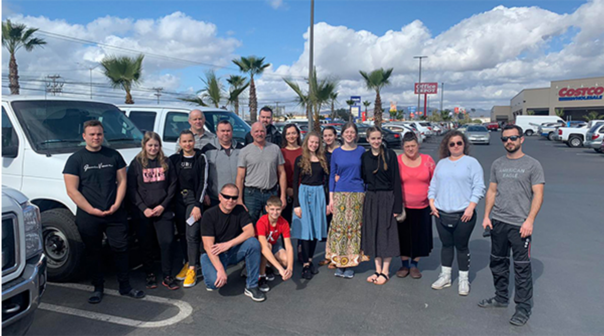
Ministering in Mexico