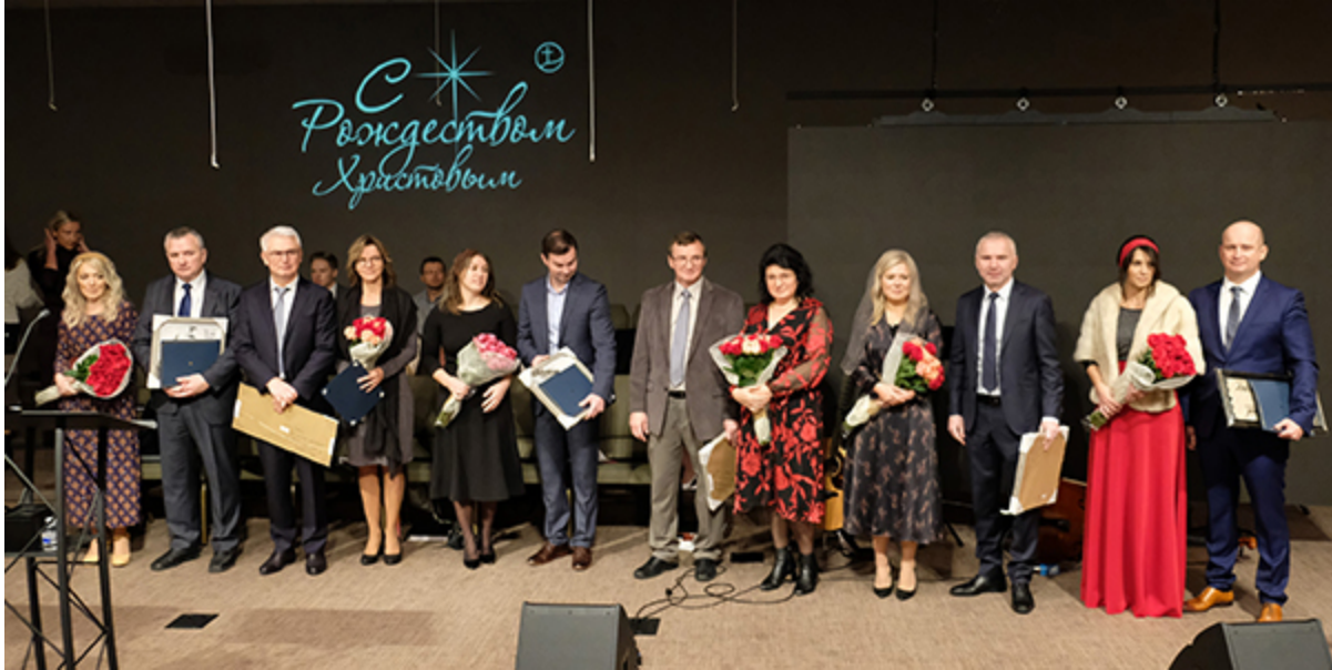
New ministers with wives