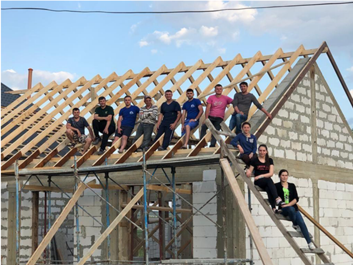
Bozen, Moldova. Together, brothers and sisters build the house of prayer

The Bible Slavic Mission talks in their newsletter of the incredible work of God. Because of the global pandemic of the 2020, it became impossible for the building teams from Germany and the U.S. to travel and enter various countries and missions' fields. However, armed by faith and boldness, the local churches began local building of the houses of prayer and Centers of Hope. They are trained and inspired by the previous building projects. The faithfulness and the unity of the brothers and sisters overcome the boundaries of countries and even continents. Read more about it here (in Russian only.)