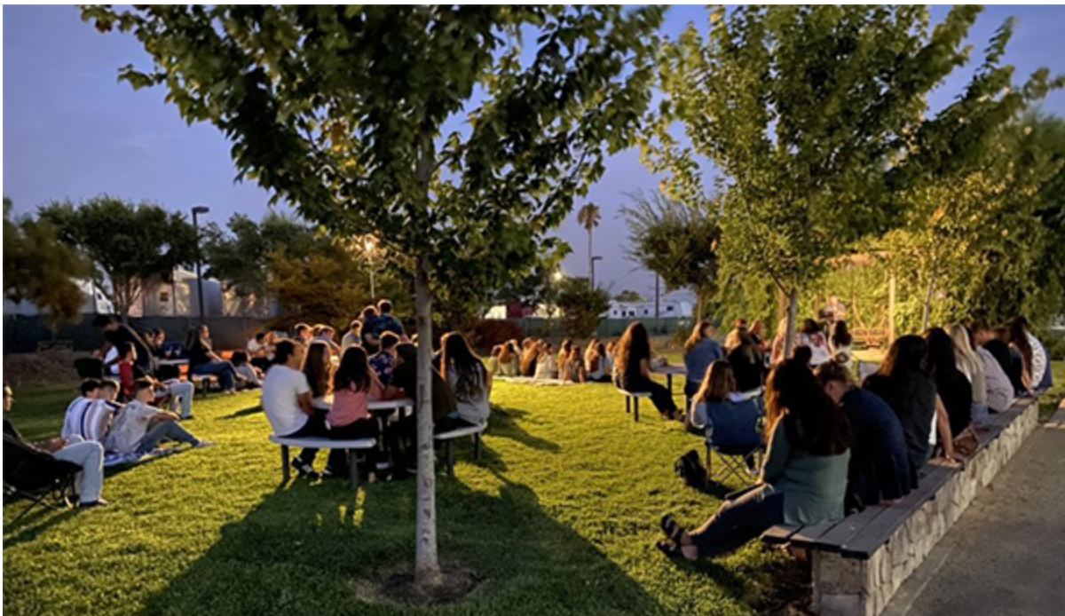
Fellowship out in the open