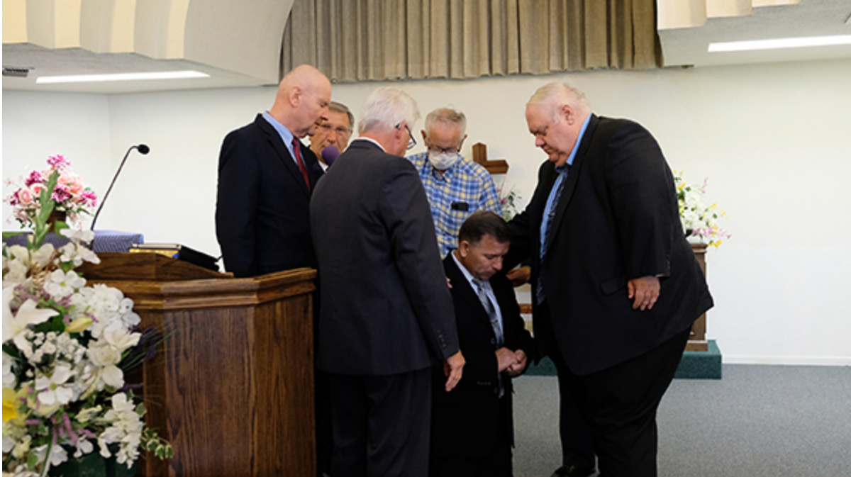
Prayer of dedication of the new head pastor