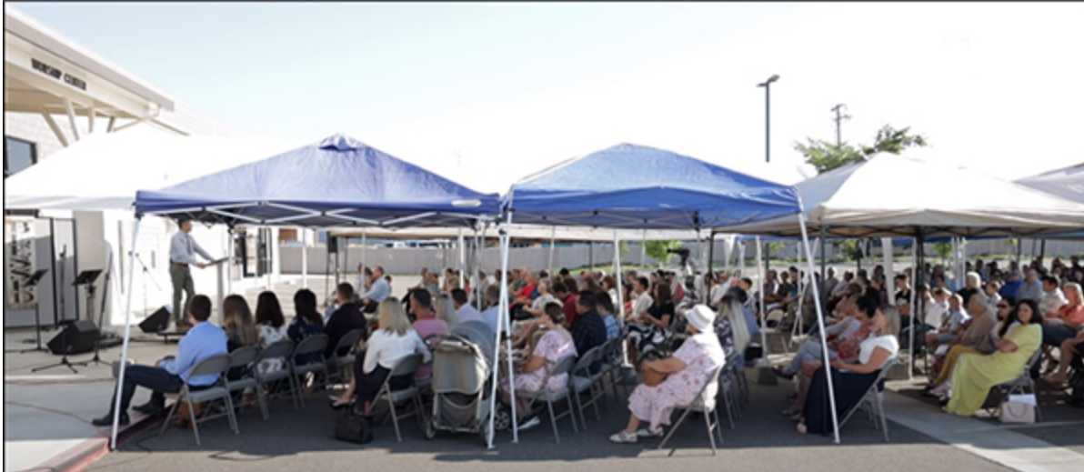
Sunday service at Grace Family Church