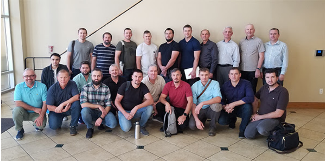
Students at Bryte Church Campus

Apparently, the pandemic had very little effect on this ministry. The teaching sessions continue, and the instructors began to come even from far countries like Belarus. For more about the ministry, read an article on the Association's website – click here .