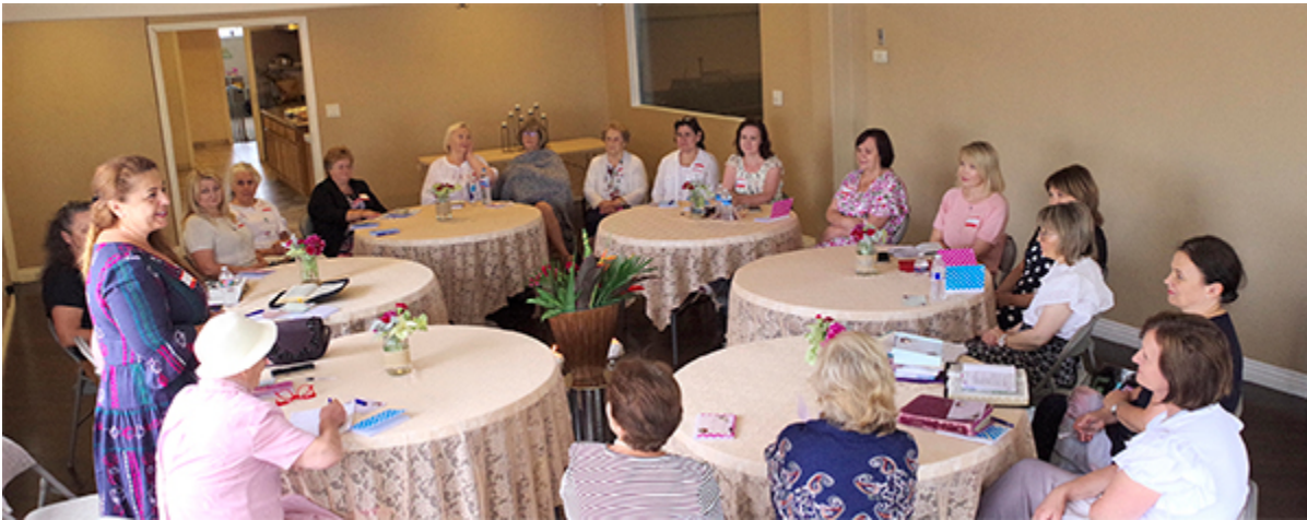
Women's Ministry Participants of the Southern Region