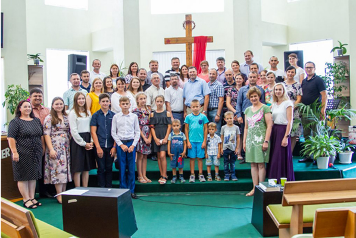
Keys Awarding Ceremony and the Recipient Families