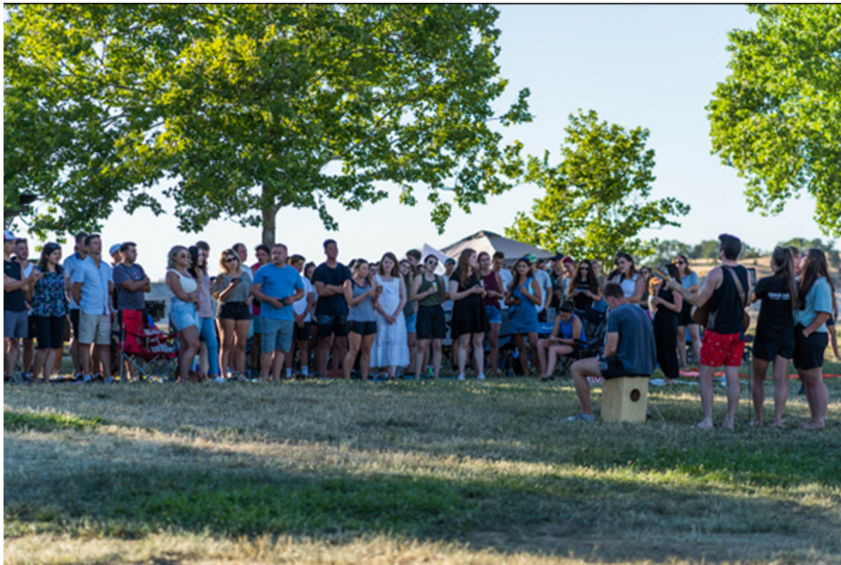
Youth Fellowship Outside