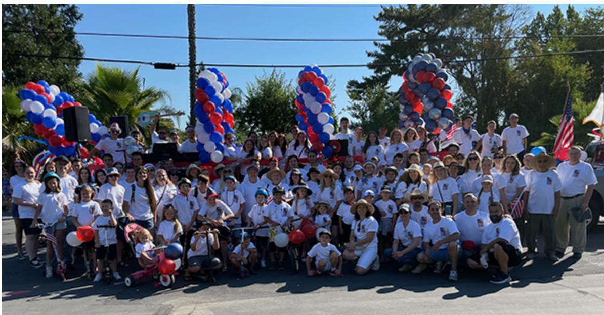
Parade's Evangelism Participants