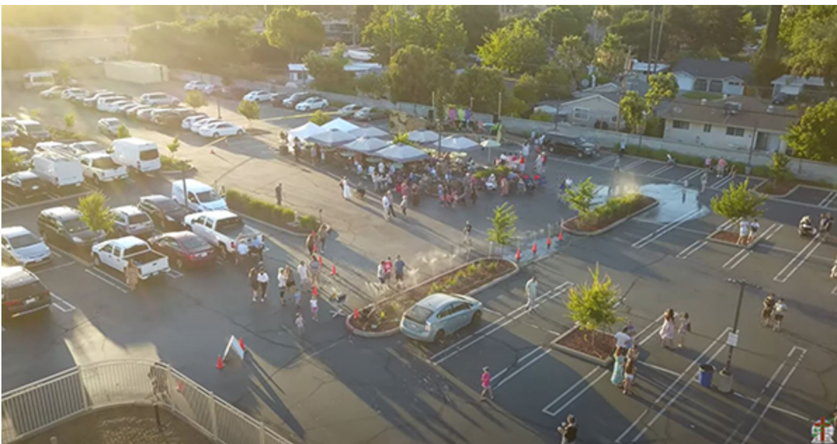
Parking Lot View During the Fellowship

Despite the extreme heat, the annual «Parking Lot Fellowship» at the Bryte church this year, just like in the previous years, has attracted many people of various age groups. After a short service, all attendees received refreshments, something to drink, as well as various games for the children. The point of these fellowship times is to give the families an opportunity to get to know one another, to attract more people into the life of the church, and to invite friends and acquaintances to live fellowship of believers. A short introductory video of this event is available on the church' YouTube channel – click this link (in Russian only.)