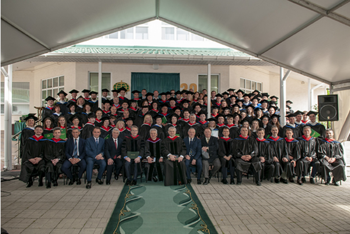
One of the 2021 Graduating Classes

Ukraine has always had an abundance of Christians and dedicated pastors. After the fall of the Soviet Union, there were new opportunities for ministry and the All-Ukrainian Union of ECB established their own seminary. This seminary trained thousands of people over the course of 30-year period and continues to provide theological training. For more about the celebration, visit the seminary's website – click here (in Russian only.)