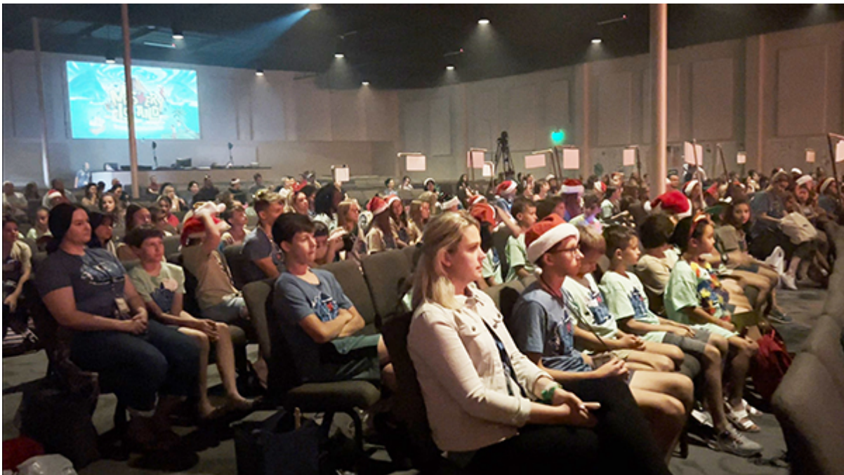
The story captivated the entire audience

A children’s summer camp took place on June 13th through the 17th at Grace Family Church , Sacramento. One hundred ninety-four children were able to attend the “Mysterious Island” of adventures and new discoveries. Forty of the attendees came from families that do not attend church. Over the course of the entire week, from 10 a.m. until 3 p.m., the children discovered more about God through Bible lessons, skits, sports, science experiments, and crafts. Read more about it in an article which can be located here (in Russain only.)