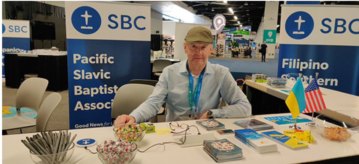
Representing the Association during the convention