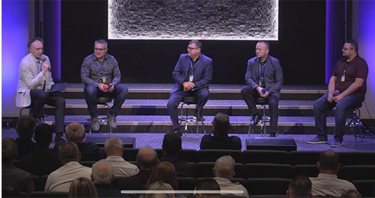
Q&A session at the convention