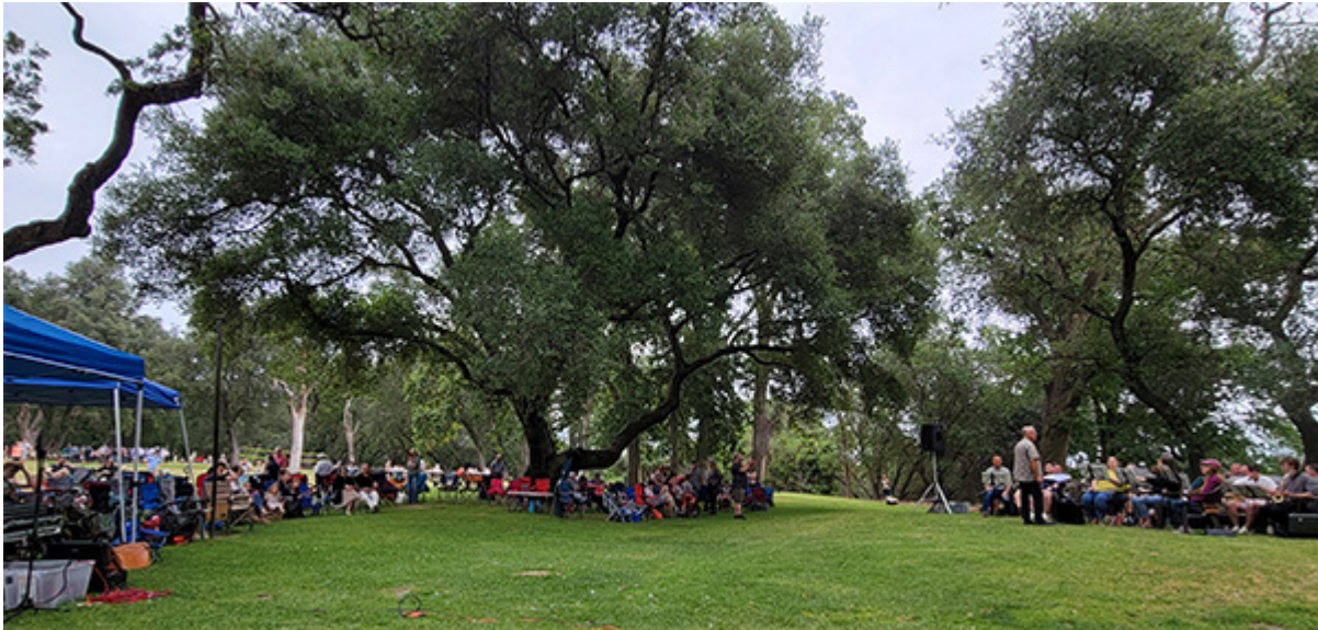
A wonderful location with a wind orchestra; what else could be better for a vacation? (Grace Family Church Picnic)