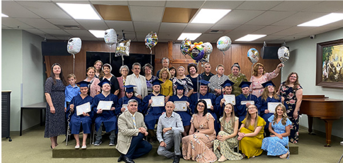
Graduates with their parents, teachers, and local church pastors