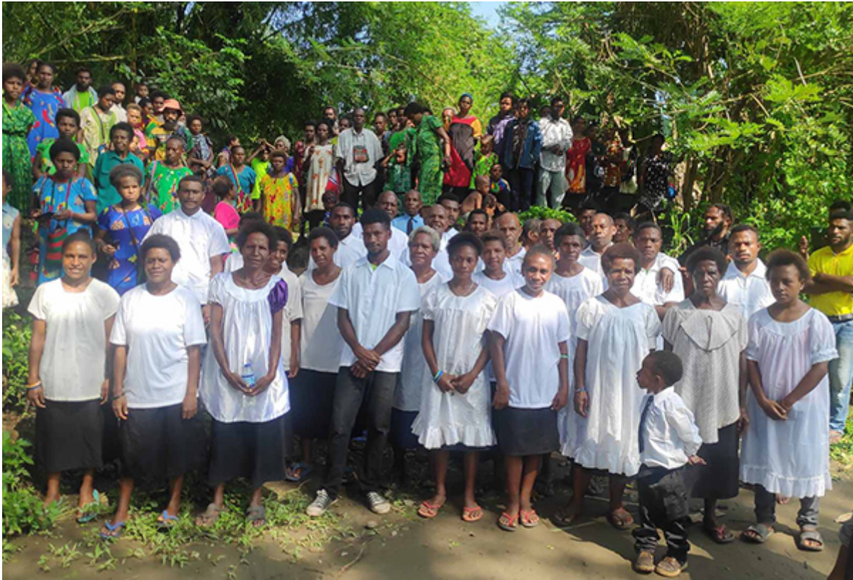
Newly baptized members of the Papua New Guinea church