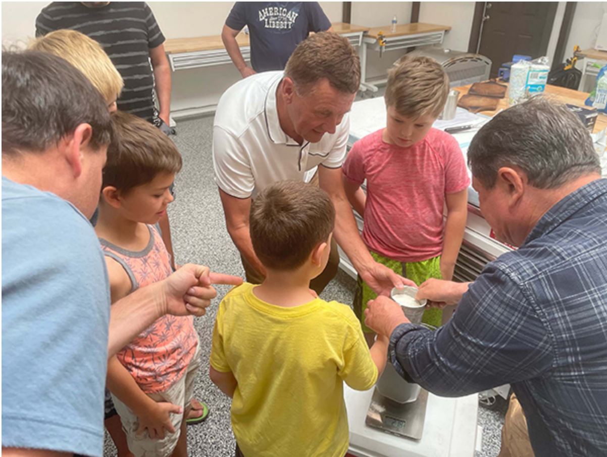
This is not as easy as it seems—to make Uzbekistani bread - lepeshka

On Saturdays, Bryte Legacy Center has children's and teens' meetings. During the meetings, fathers and sons study together, read God's Word, and memorize Bible verses. This time, in the season of the Father's Day celebration, The Bryte Legacy Center had a culinary master class for the boys. Read more about it here (in Russian only.)