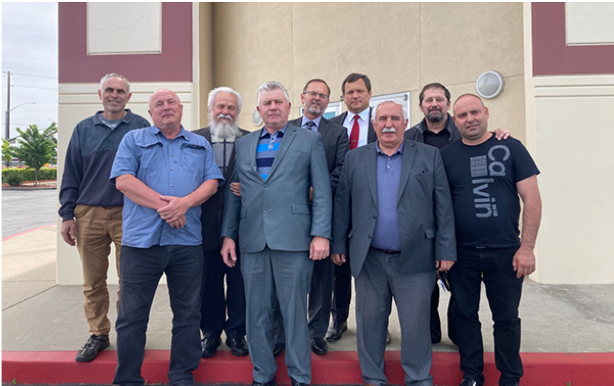
Prison Ministry Team