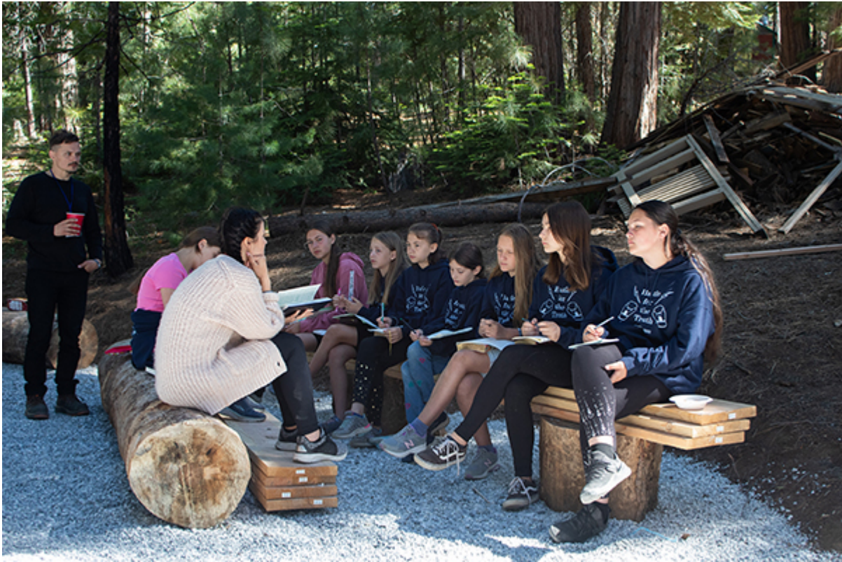
Lessons out in nature