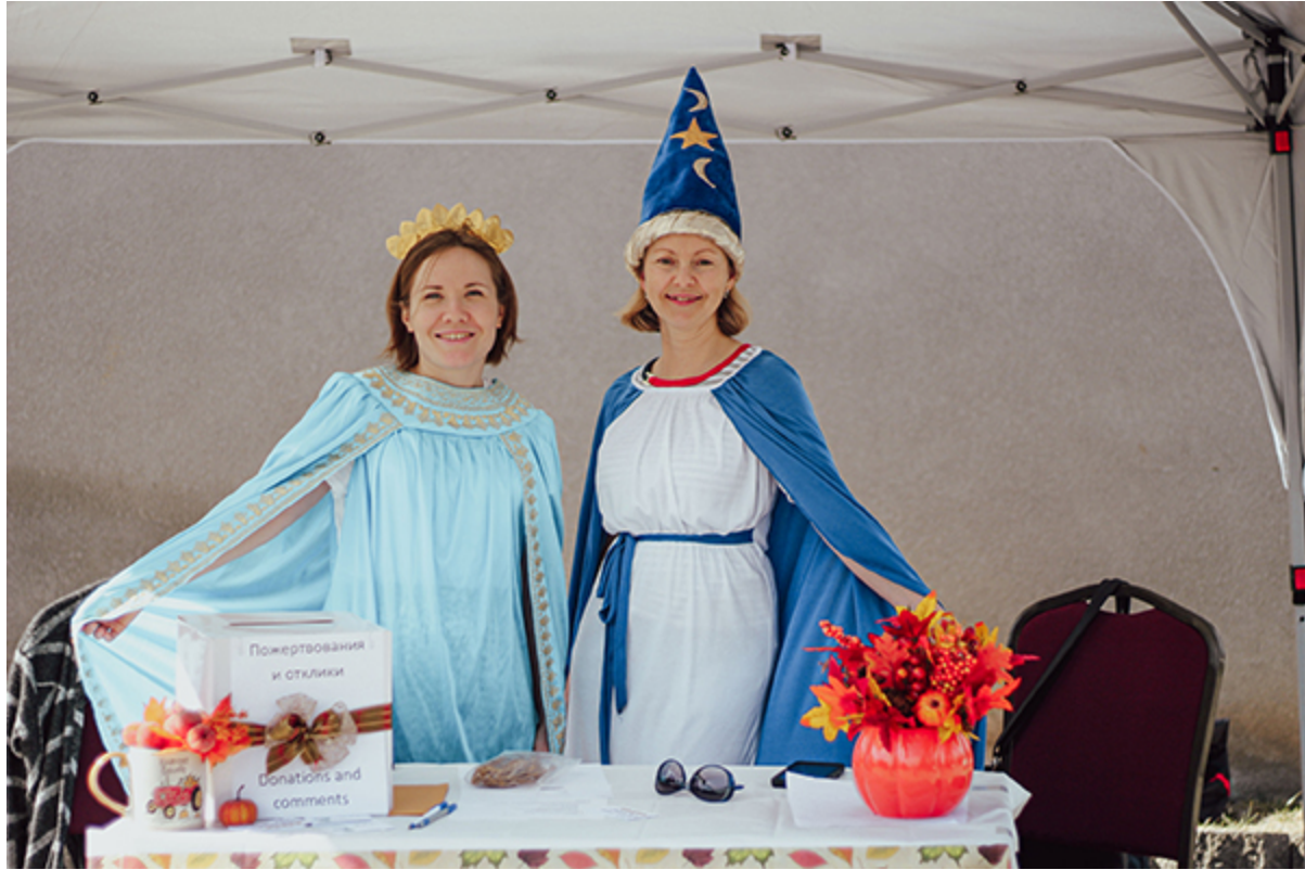
One of the festival's stations