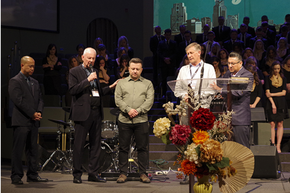
Prayer for peace in Ukraine