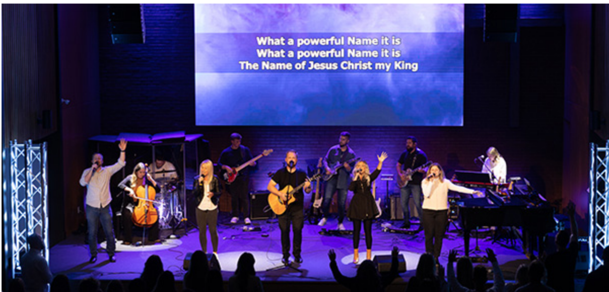
Youth during worship