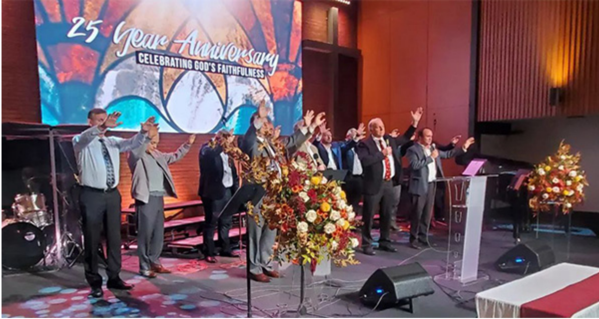
Pastors' prayer for the church