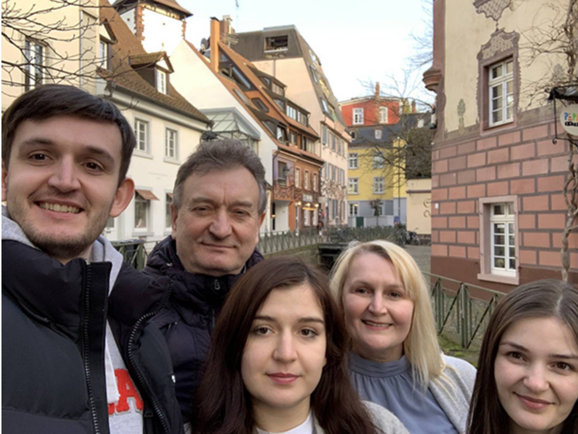
The missionary's family