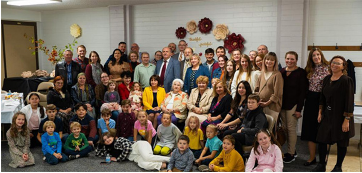
Group picture after the Harvest celebration