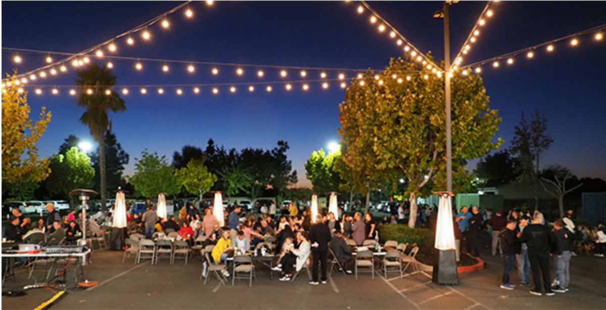
The fellowship was very relaxed