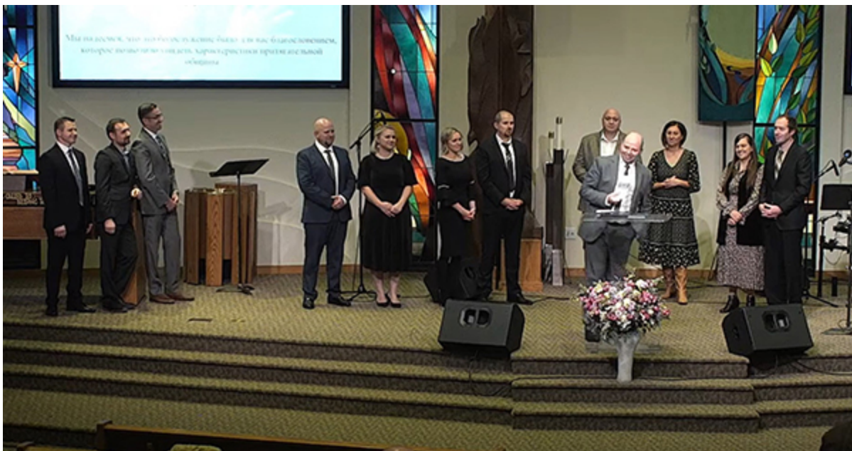
New church deacons and their wives