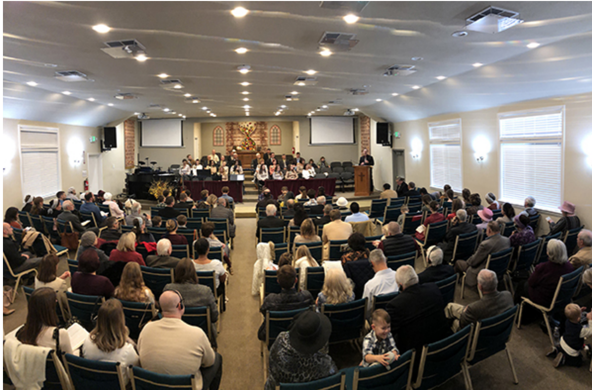
During the celebration service