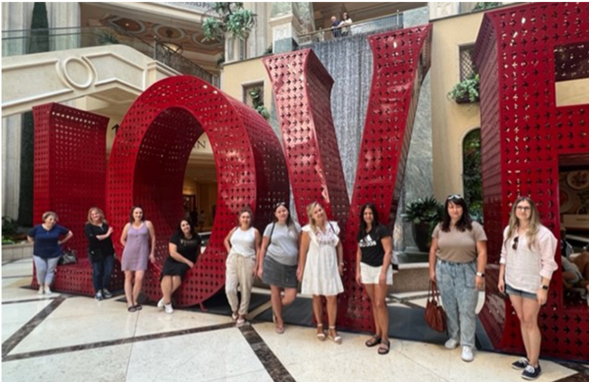
At the conference