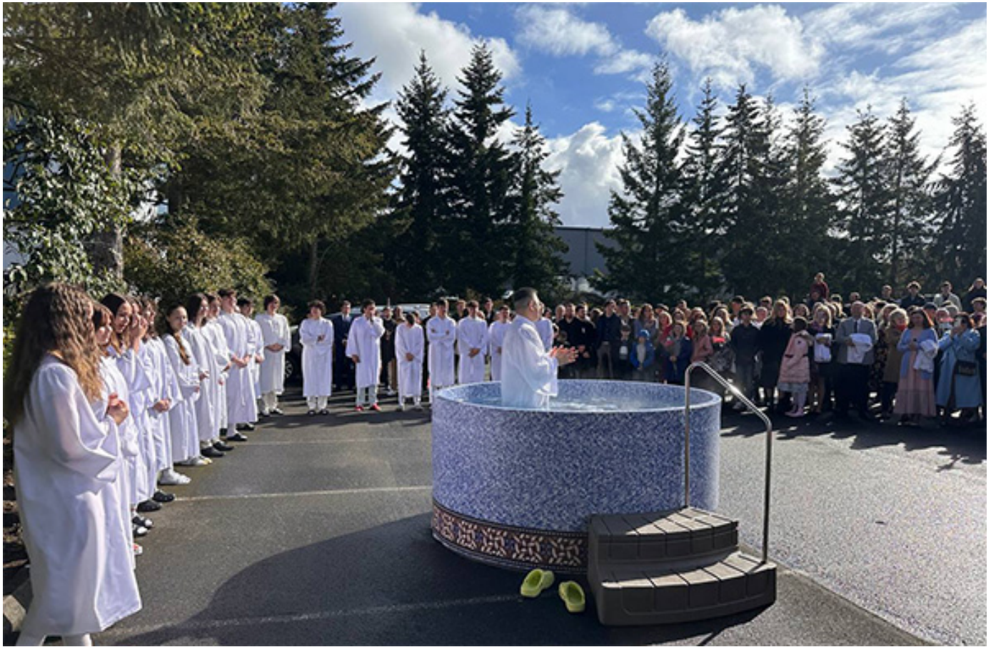
Baptism of Twenty People