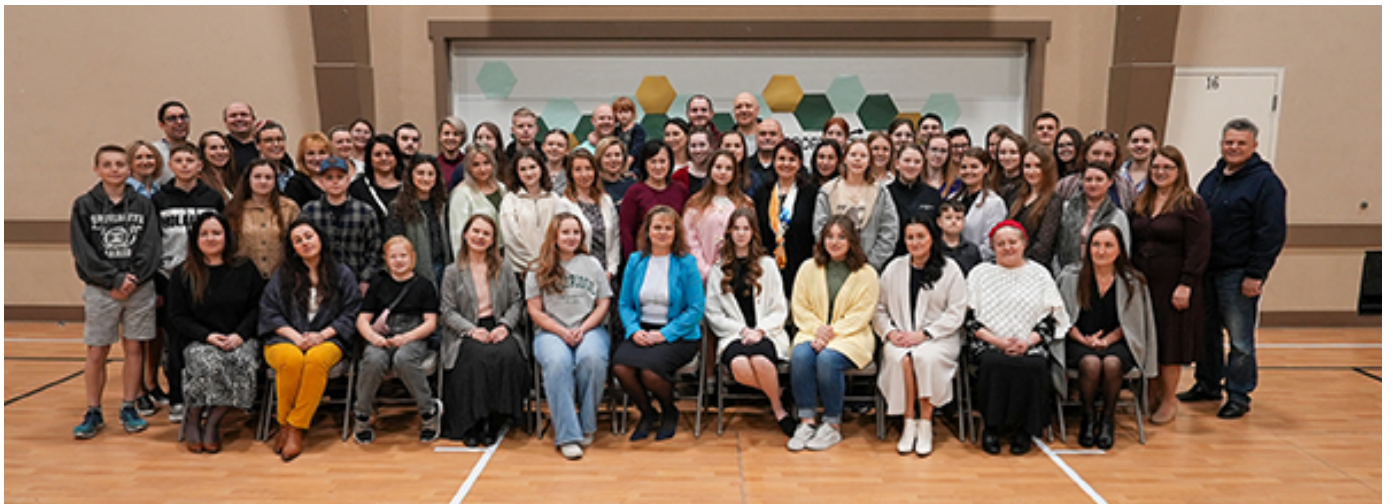
This is how many of us were there! This is only part of those who serve in the Sunday School ministry of our churches.