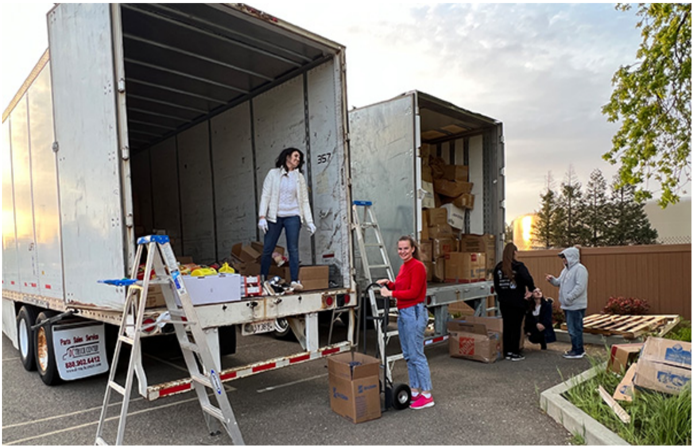
During the Time of Gathering Donations