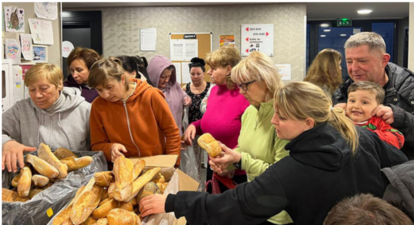
Sharing Bread with Refugees