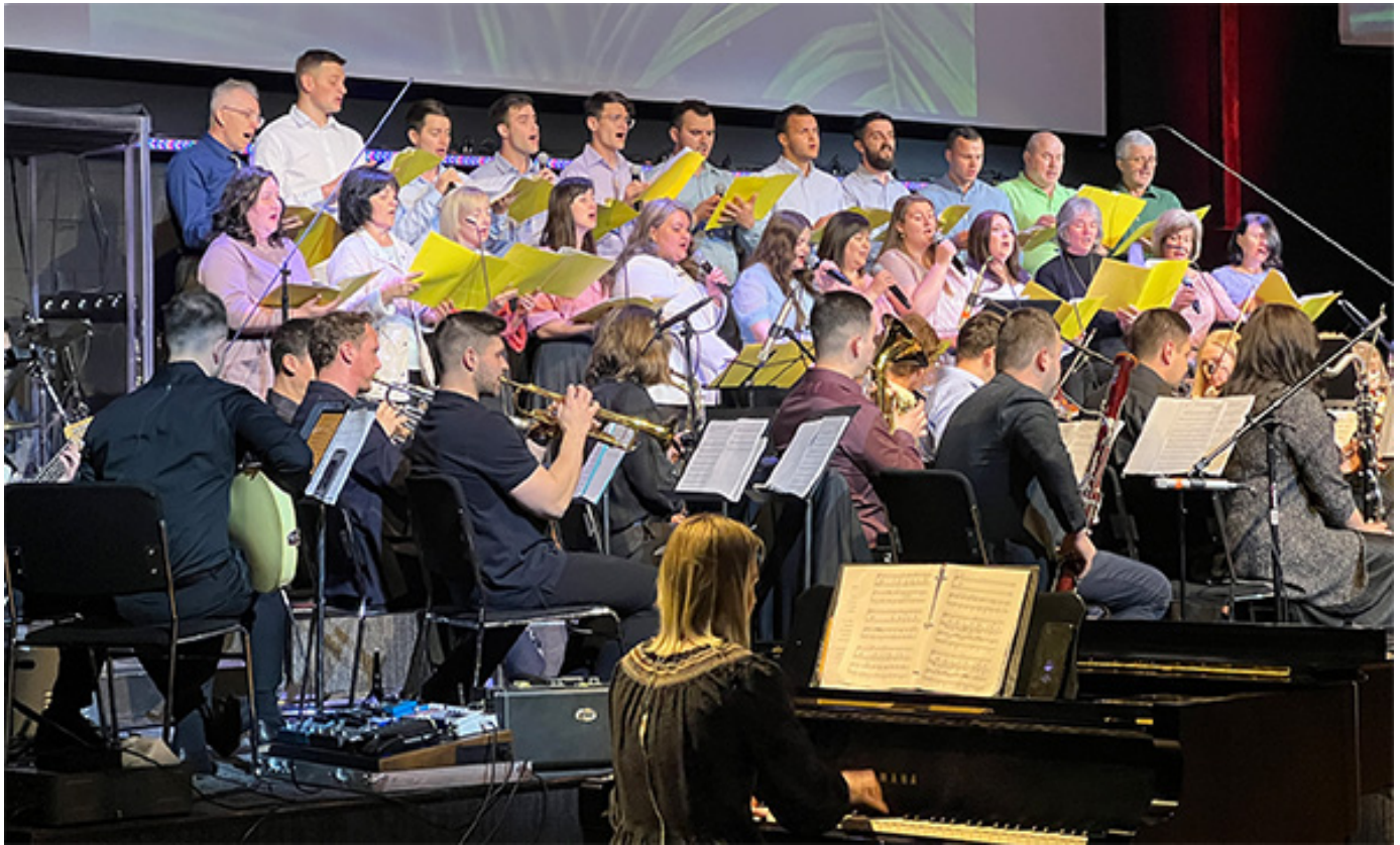
Choir Participation with Orchestra's Involvement