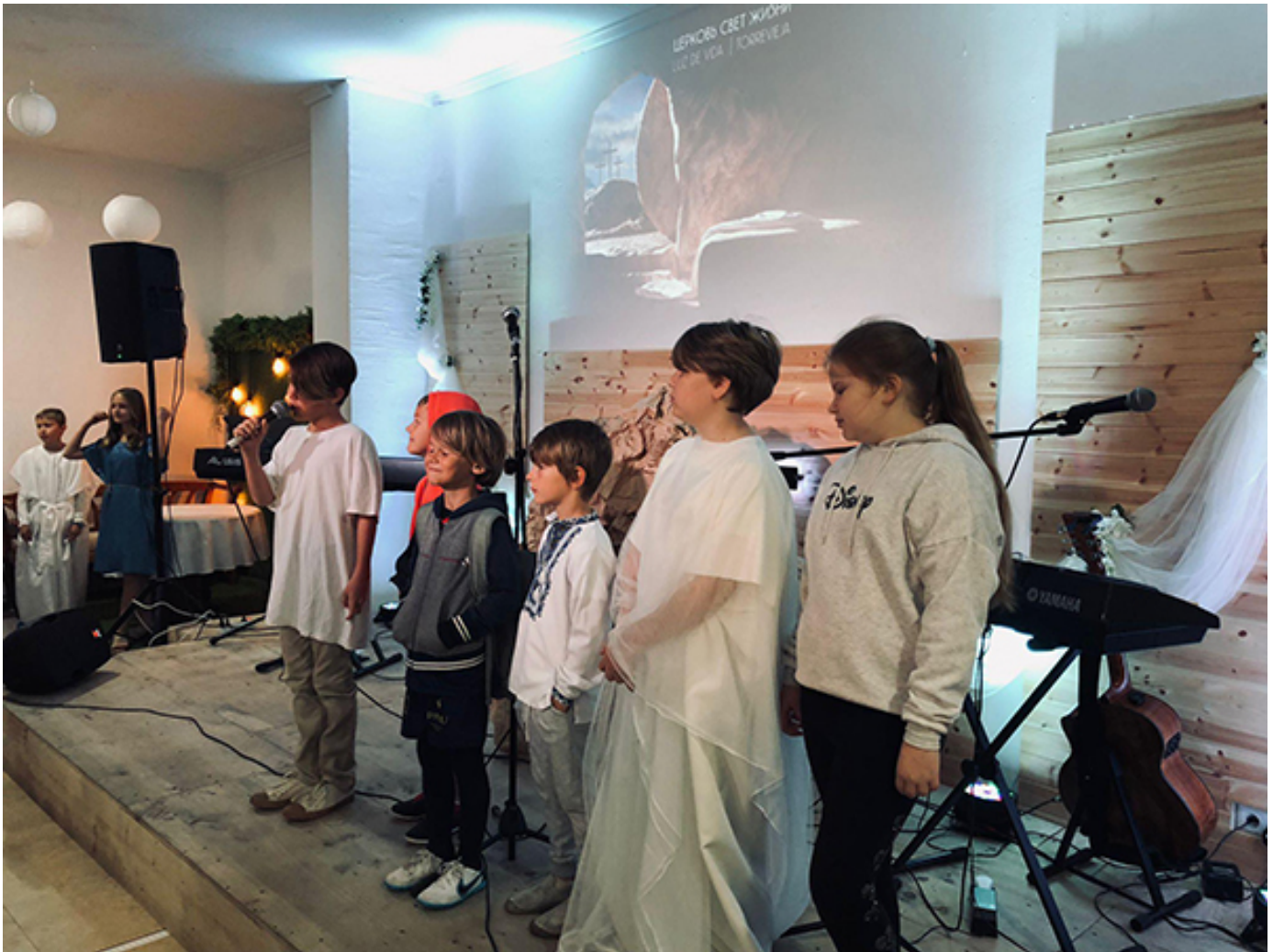
Sunday School Involvement in the Celebration