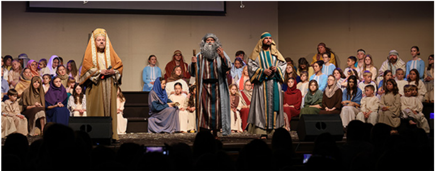
Scene from the Play