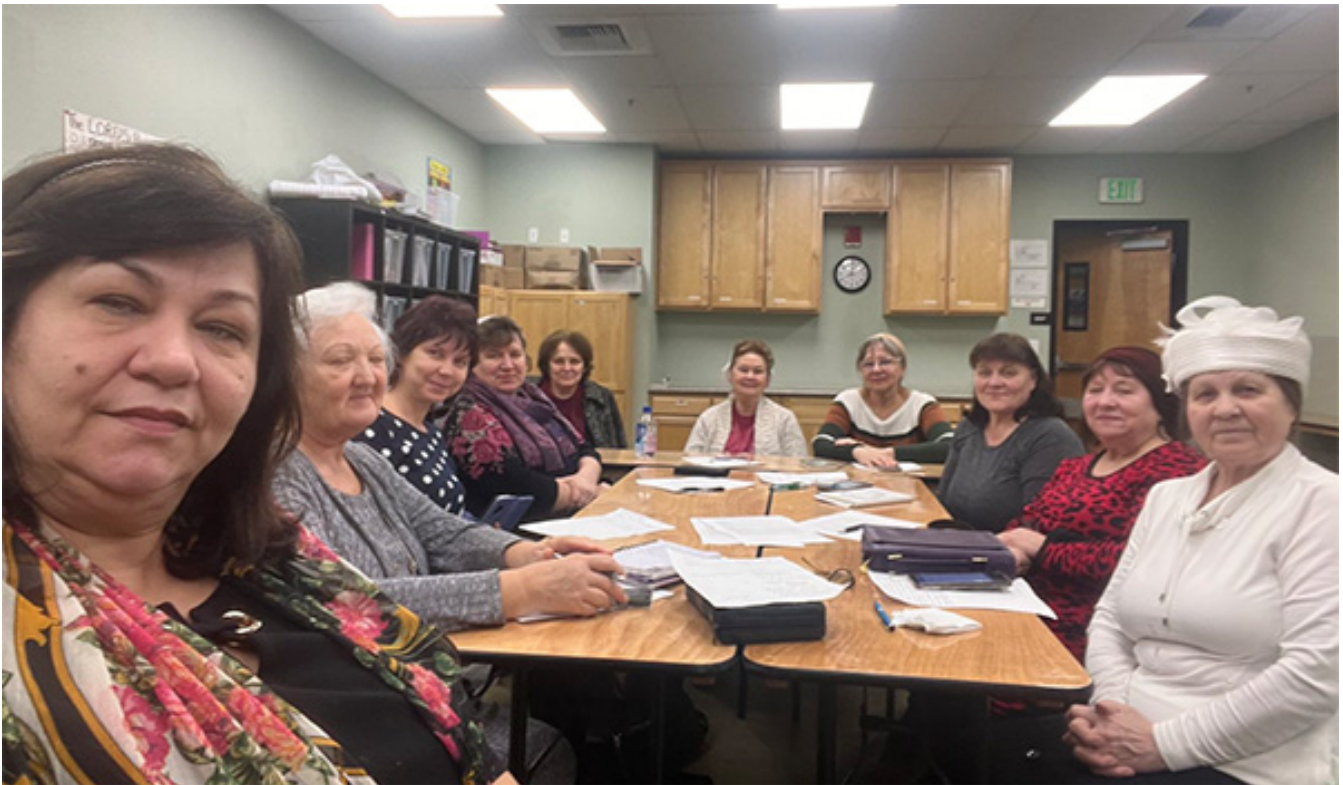
Meeting of the women's committee