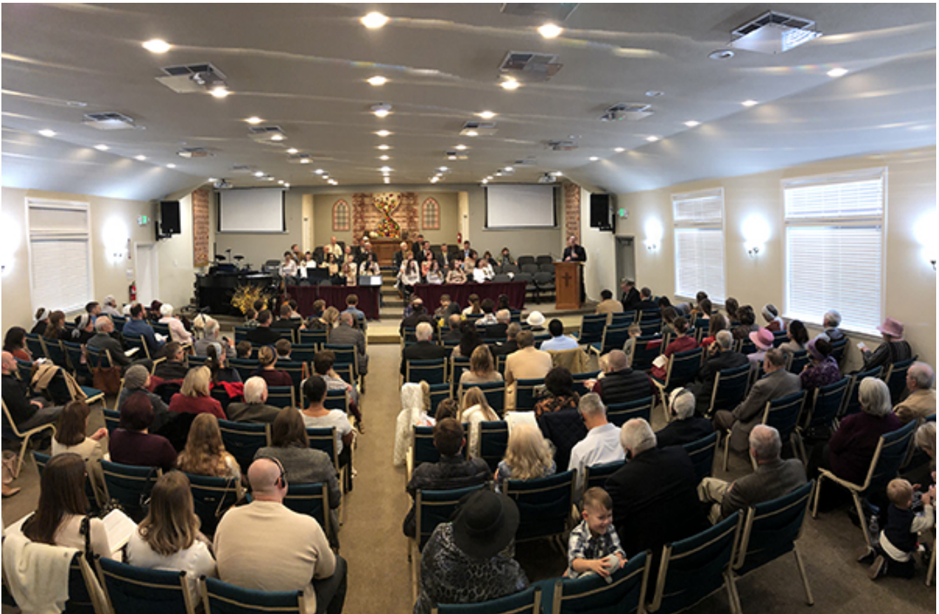
Mission Boulevard Baptist Church today...