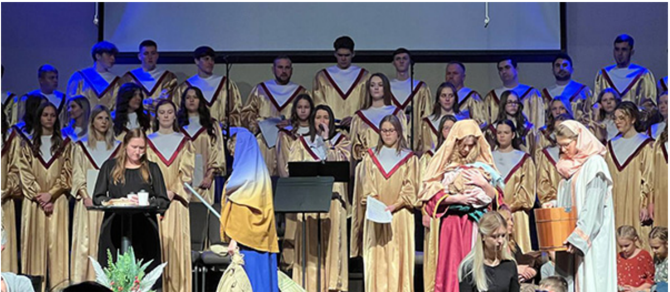
Сцена из постановки