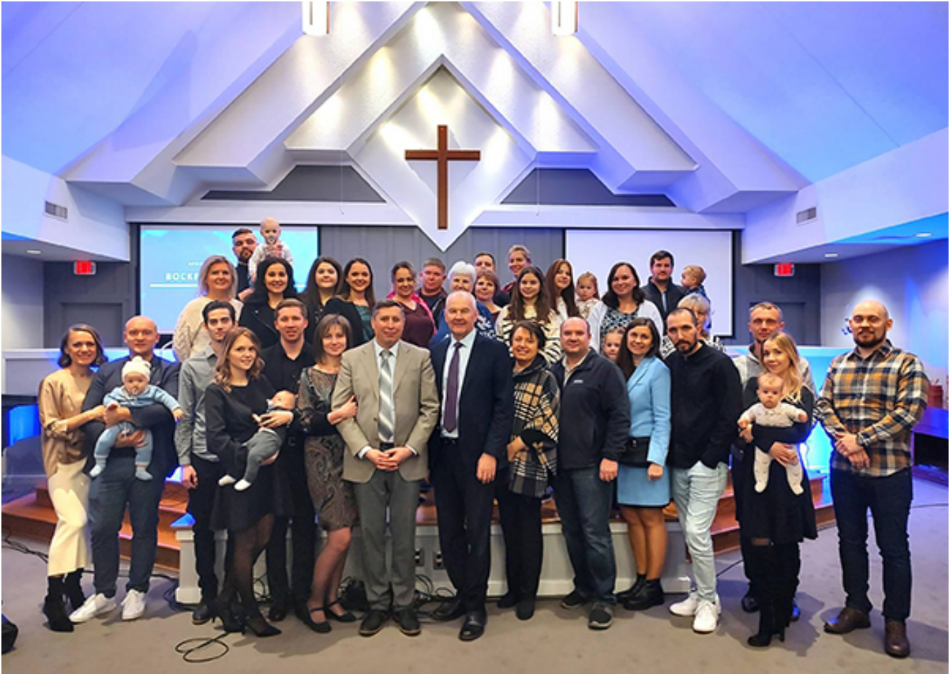
Spring of Life Bible Church after their first service, Greenville, South Carolina

We welcome these churches in our Association, wish them blessings from the Lord, and hope for successful cooperation with them in serving to God.