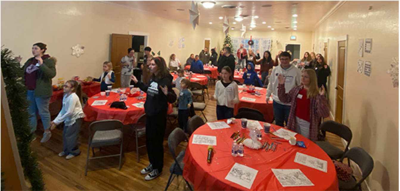
During the game