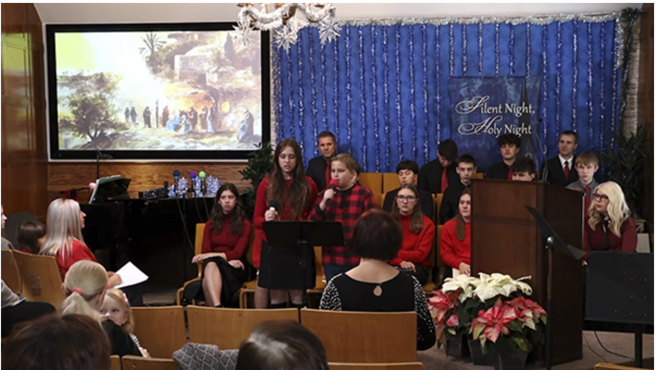
Scene from the play

On January 8, guests from First Slavic Baptist Church in Sacramento visited First Slavic Baptist Church “House of the Gospel” in San Francisco. The Christmas greetings and blessings, choir singing, and children’s program, as well as the preaching of the Word and prayer, encouraged brothers and sisters of the small church in San Francisco. Details can be read in an article by O. Chanova (in Russian only.)