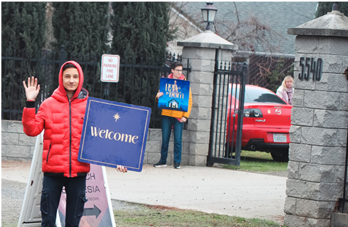
Welcome to the new church building!

The church service was evangelistic. For more information, read an article by S. lotko – click this link (in Russian only).