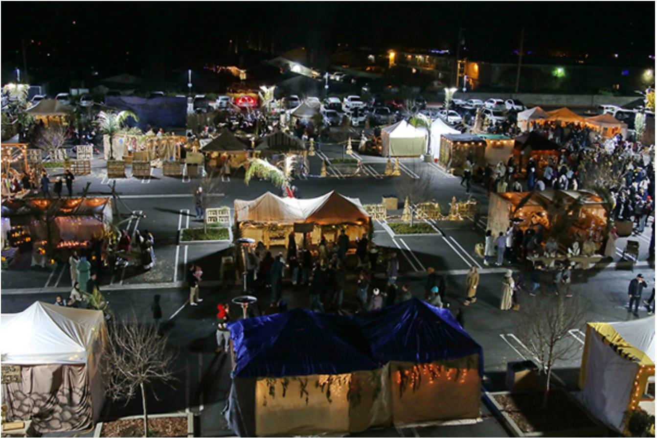
The Bethlehem village...