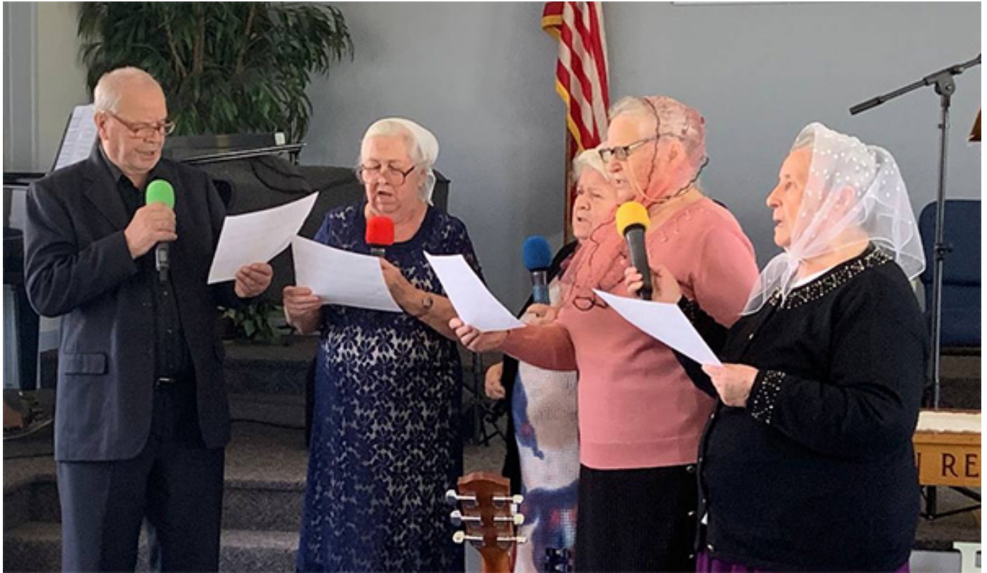
Guests from Altamedix singing