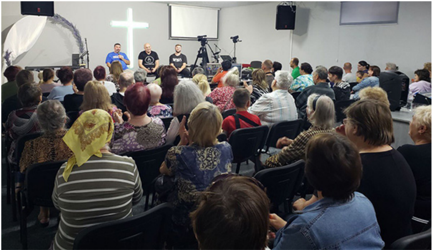
During one of the meetings in Ukraine