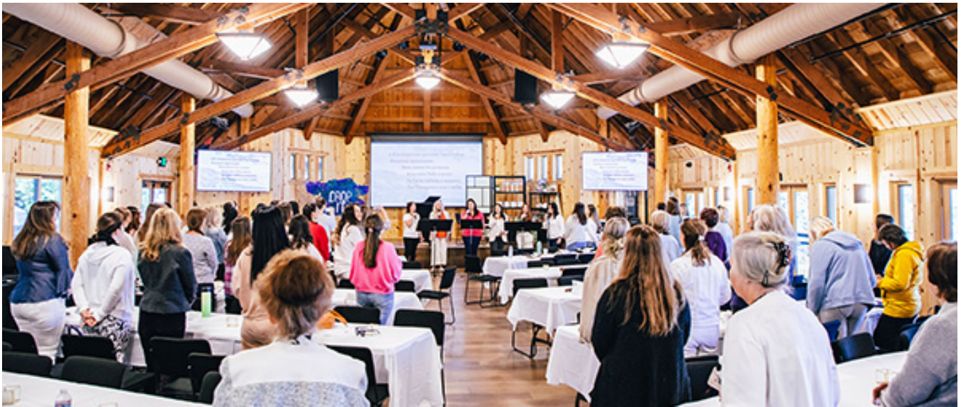
Worship service during the retreat