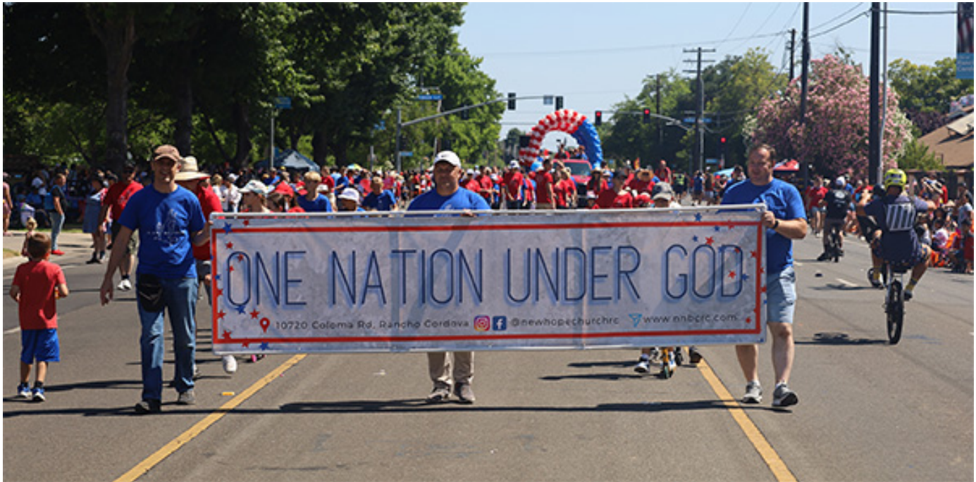
Church Involvement in the Parade