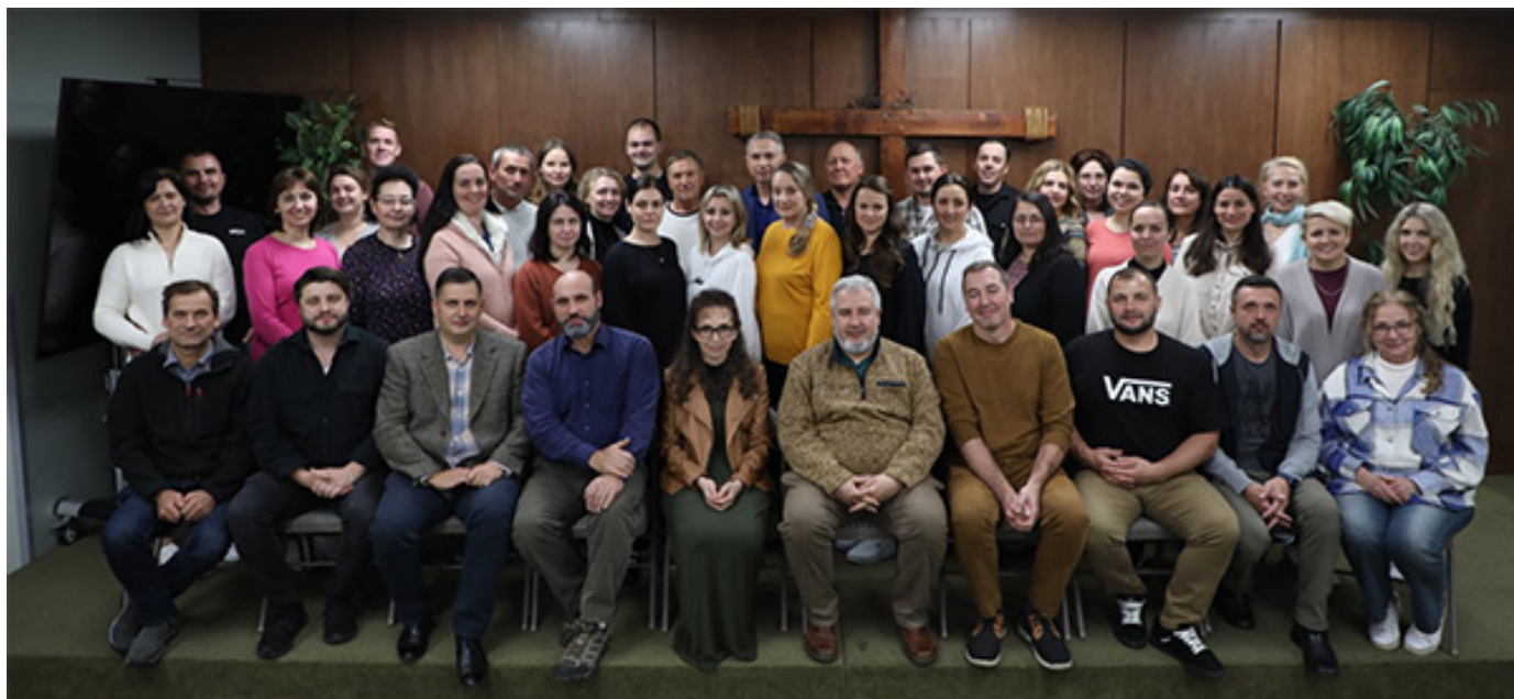
Group of students and instructors of the second intake

One of the students, who is the youth pastor at Grace Family Church, shared his thoughts on the important lessons that he learned while attending three modules of Coram Deo. Read his article on the Association’s website (in Russian only.)