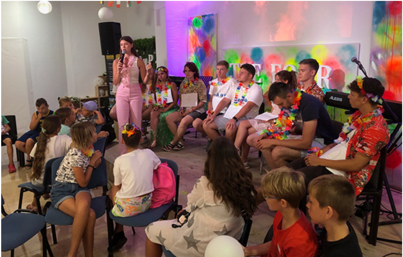
Bible lessons during the camp