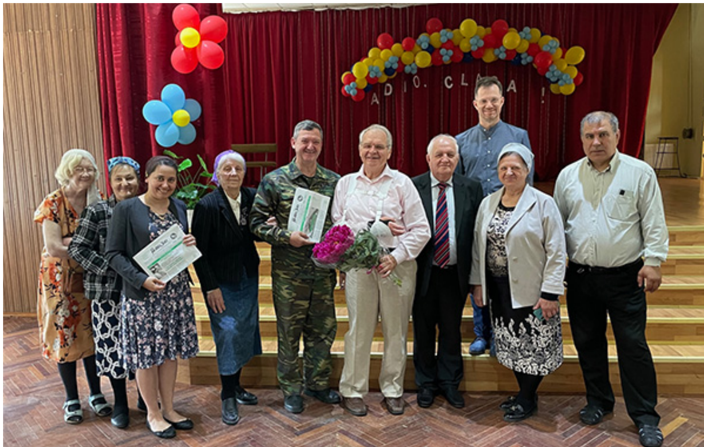
One of the meetings in Moldova