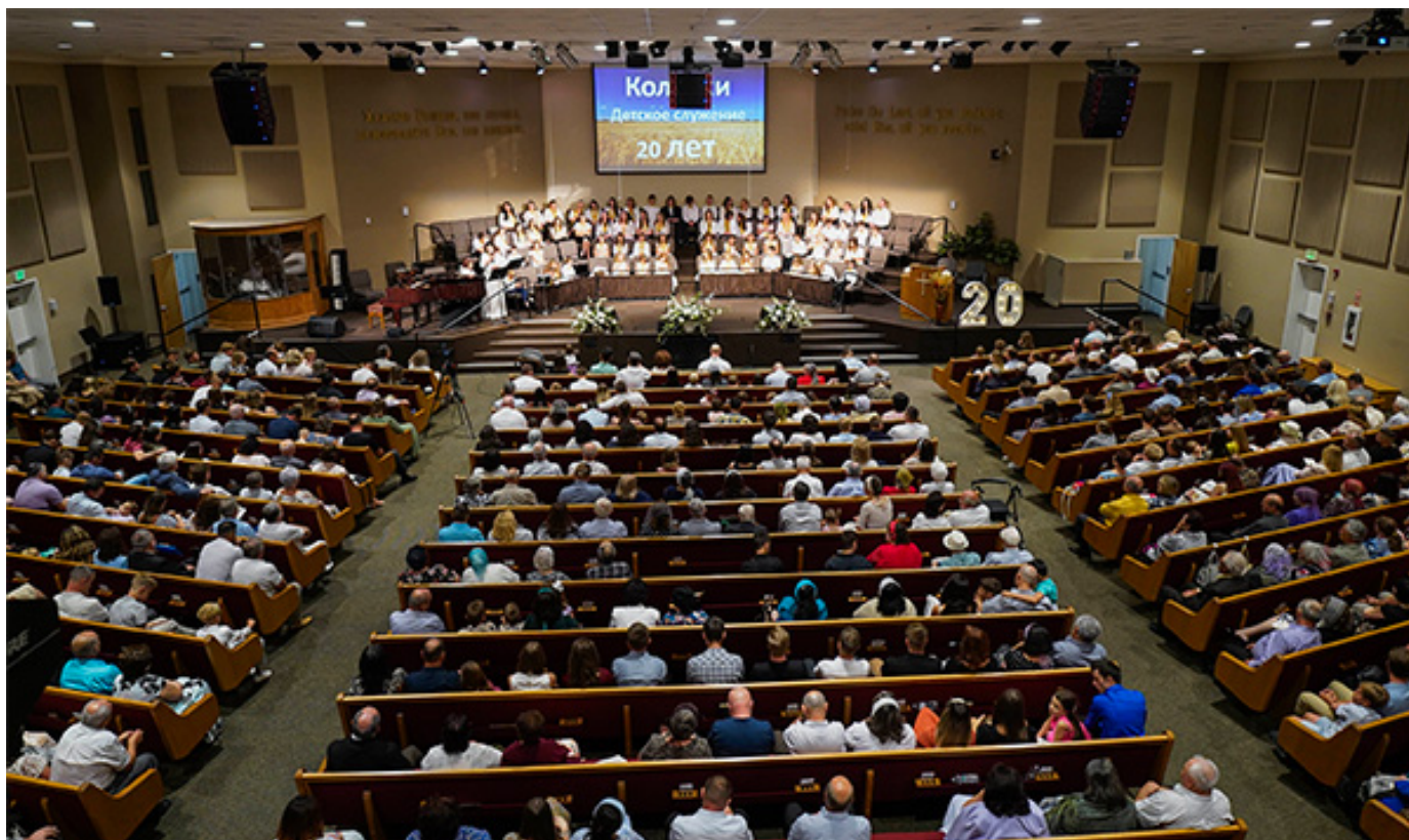
Celebrating the anniversary

During these 20 years, the choir participants were able to perform in numerous events of various themes, women’s ministries, prayer breakfasts, widows’ meetings, as well as church services for children with special needs. More information can be found here (in Russian only.)