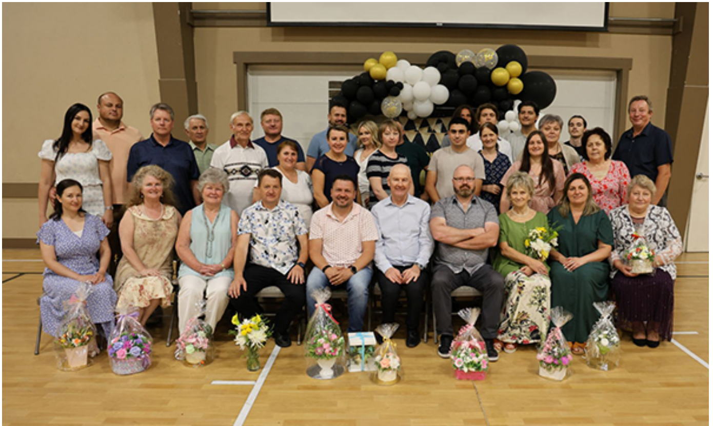
Staff and volunteers of the store