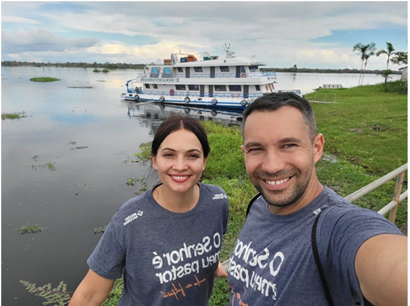
On the Amazon River