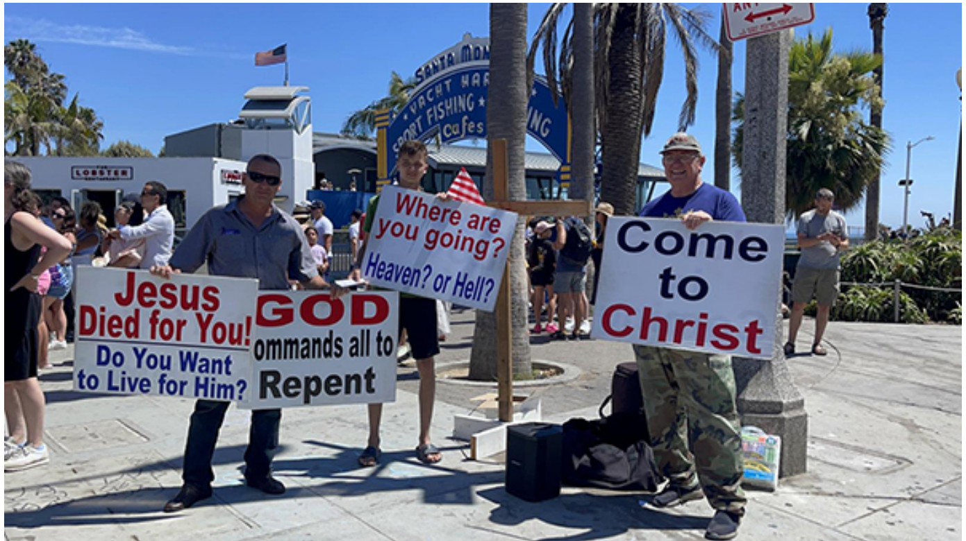
On the beach in Santa Monica