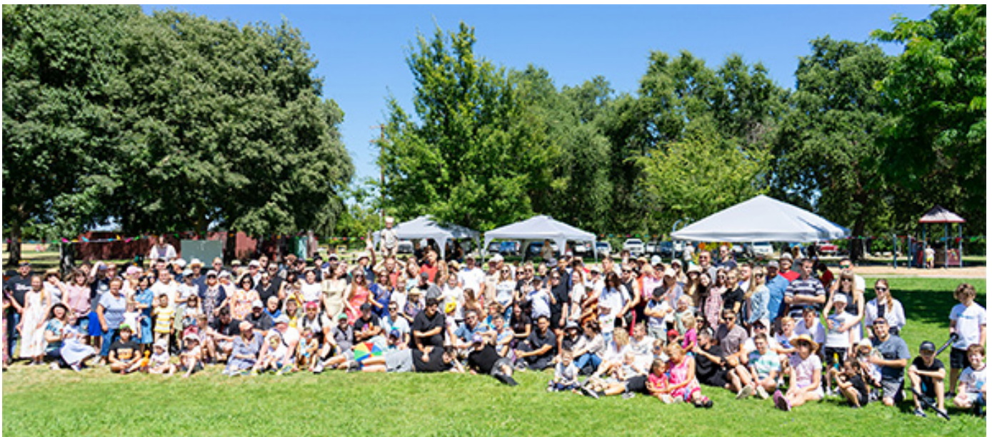
At the picnic

On July 9, after the morning service, the Cornerstone Church had a special picnic for immigrants. Over 350 people were able to attend, and it was a great success! Many immigrants came to church for the first time, and some of them were very surprised how they were able to feel the warmth and be so comfortable in the company of Christians. More can be found here.