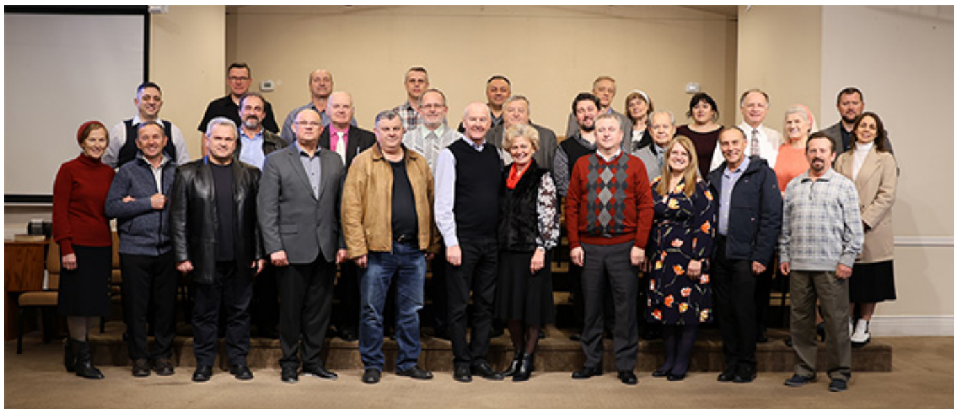
Pastors and their wives who attended the meeting in West Sacramento

A similar meeting also took place on March 11 in Montebello for the pastors of the southern region. Read about it here.