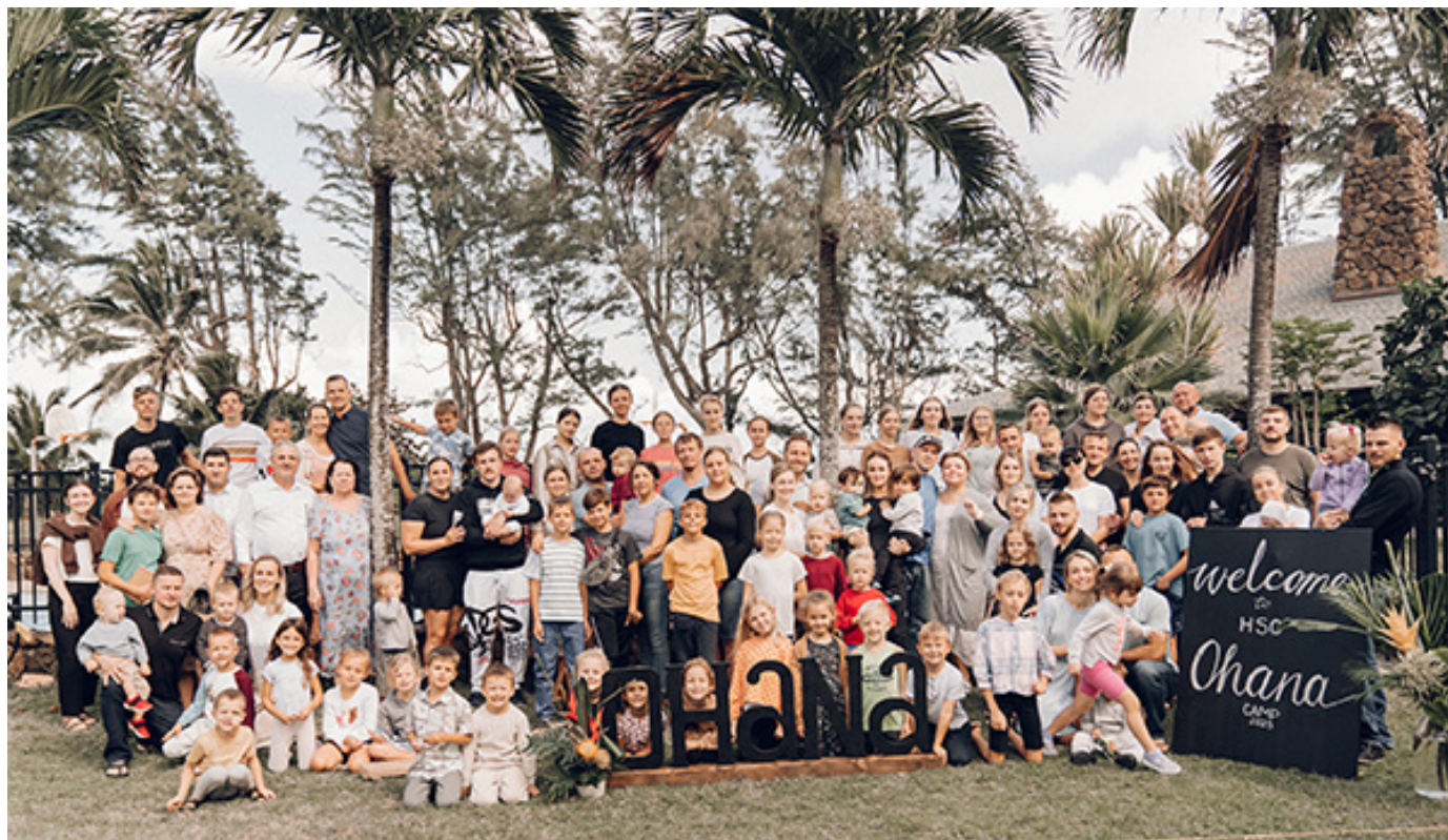
Family conference attendees