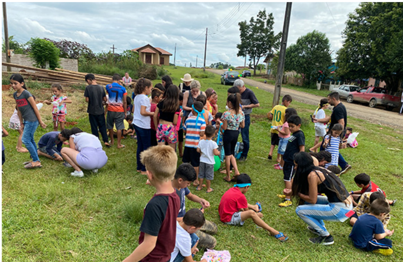
Spending Saturday with children of the poorest area of Favela