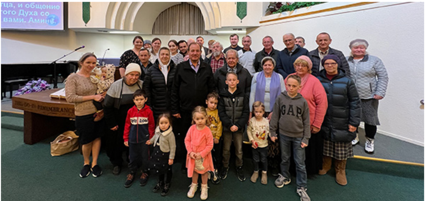
Word of Life Church