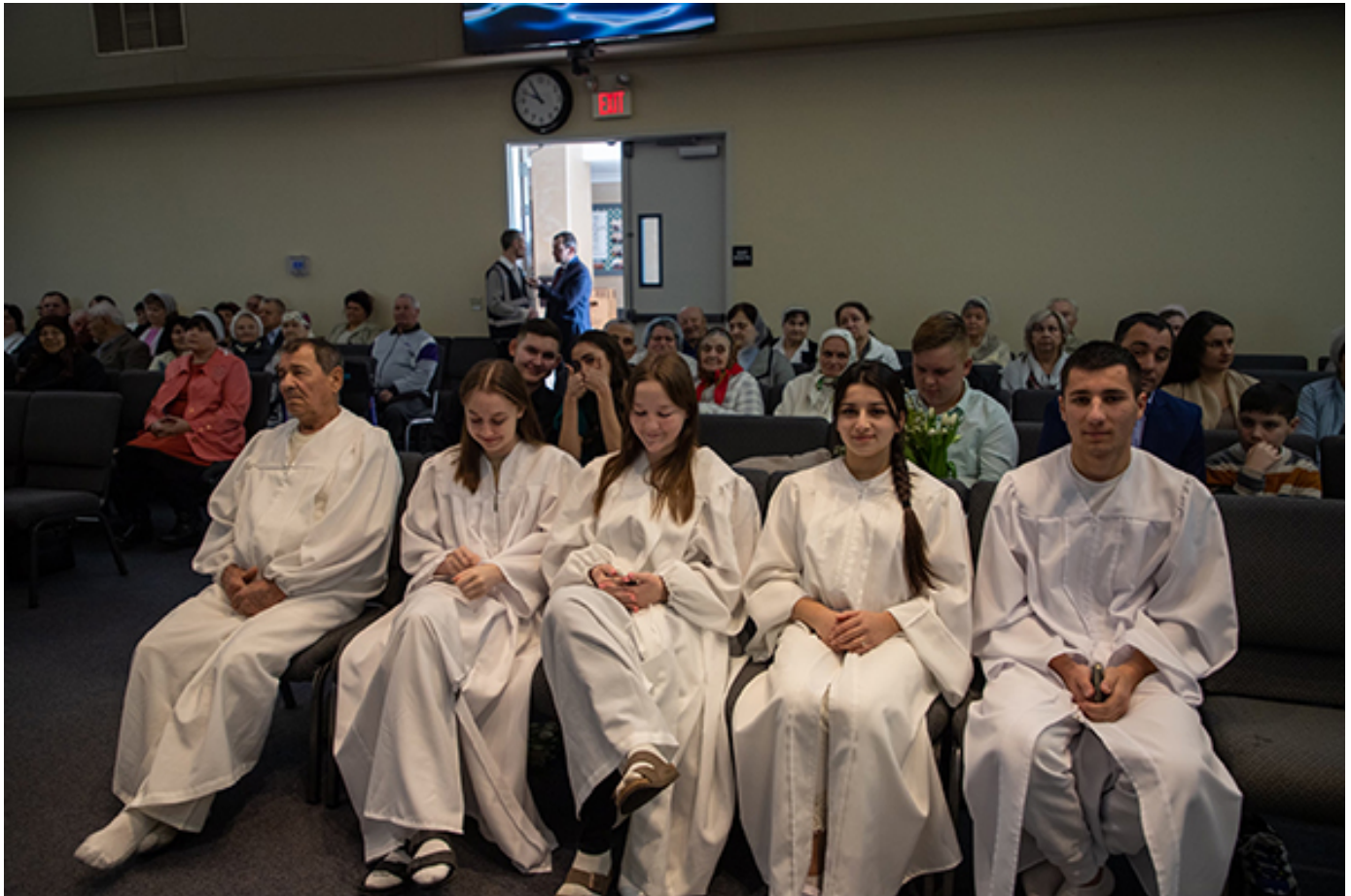
New church members