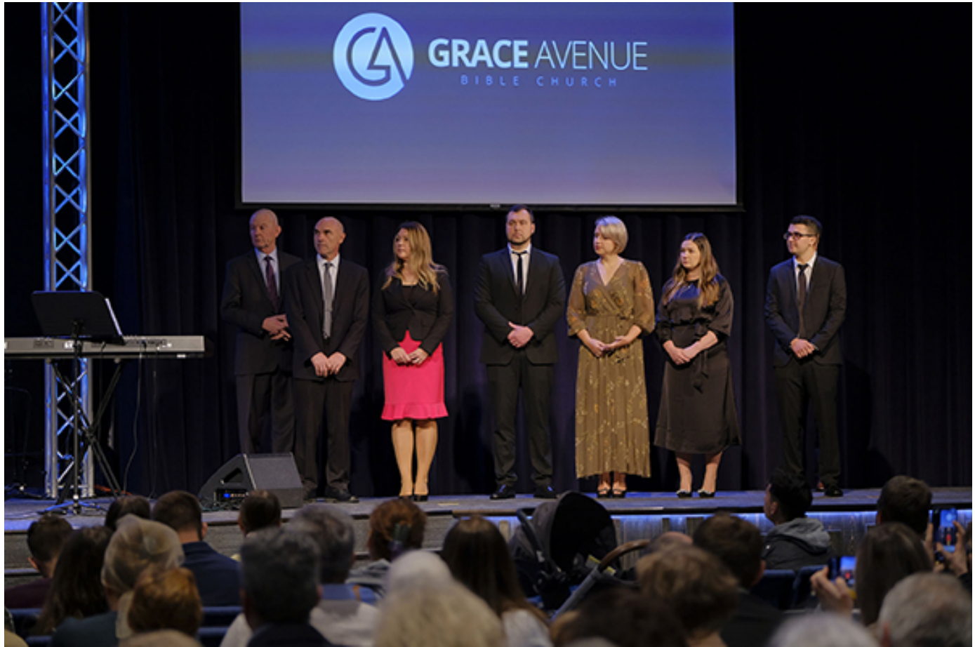
New pastor and deacons