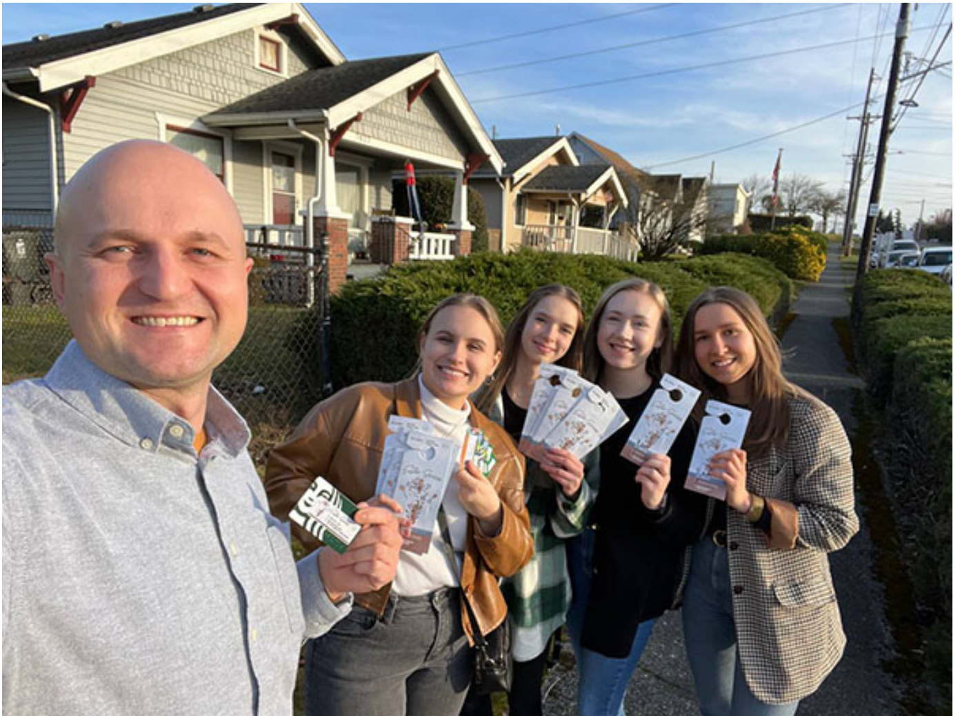
During street evangelism