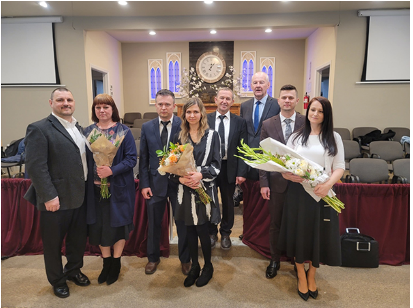
New ministers and their wives