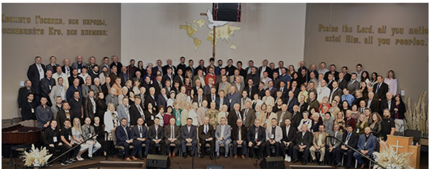
The Conclusion of the Convention - Group Picture

This was a convention with re-nominations and reports. The ministry leaders and the Association's audit team presented reports to the representatives of churches and members of the Association about the work that has been done over the year, and the use of the funds. The new executive committee team of the Association was also affirmed, and the new budget for the year was ratified. For more information, read here (In Russian only.)