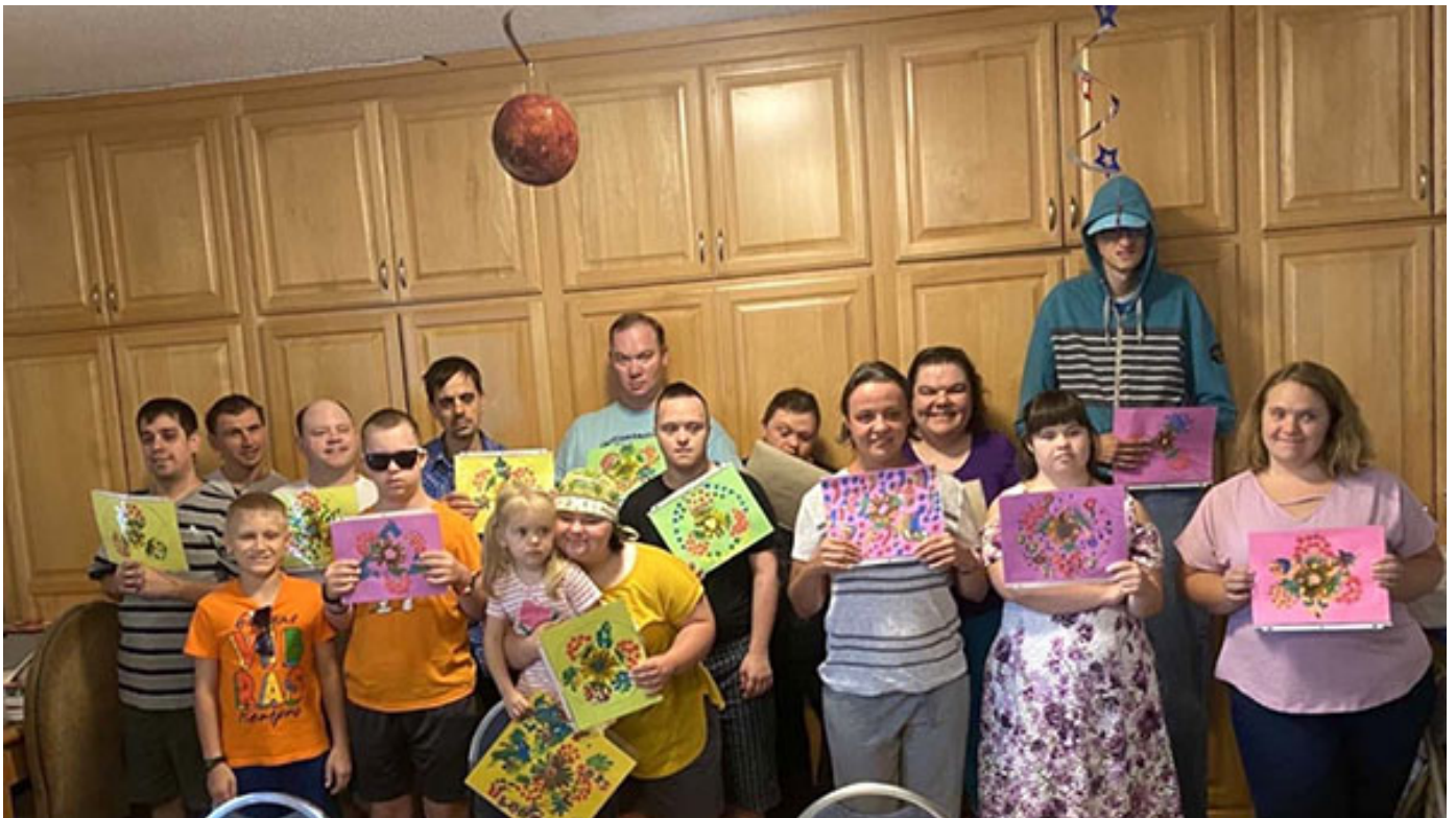
They made these themselves!