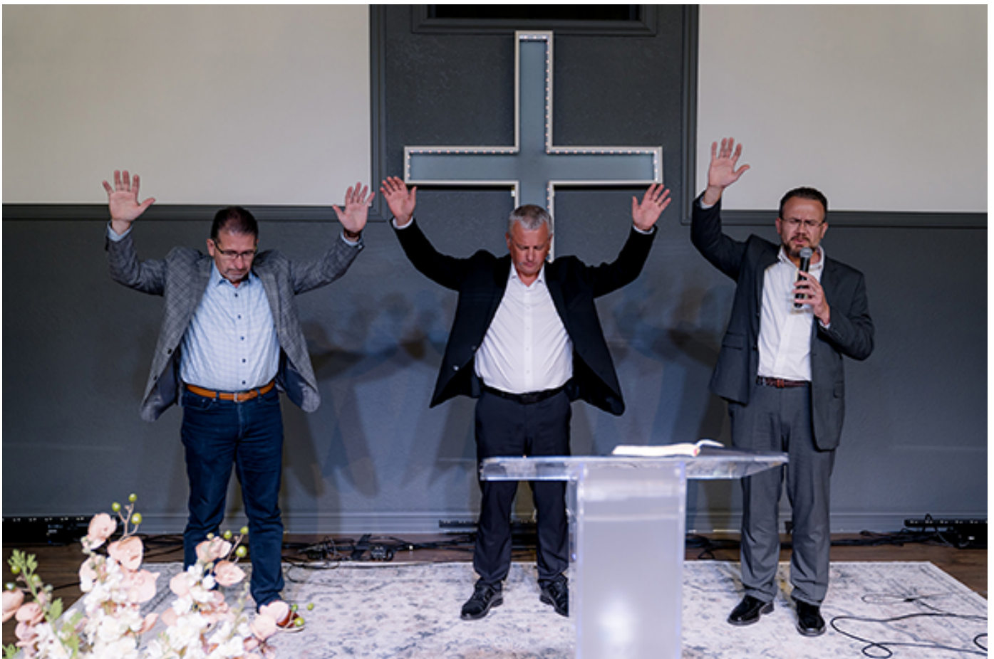
Prayer of Dedication

God miraculously answered this need and these prayers, and helped the church purchase a building on credit that the church had previously rented. On October 8, there was a celebration and a dedication of the church to the Lord. Read more about it in an article by the church pastor, M. Kucherenko (in Russian only).