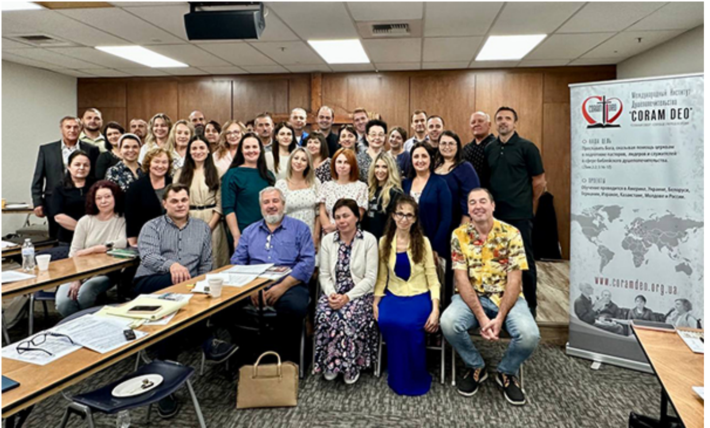
Students and Teachers of the Fourth Module