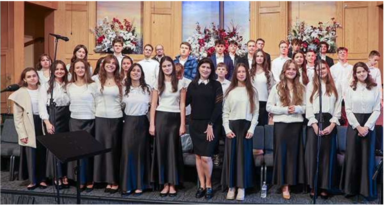
Youth Choir at the Grace Avenue Bible Church