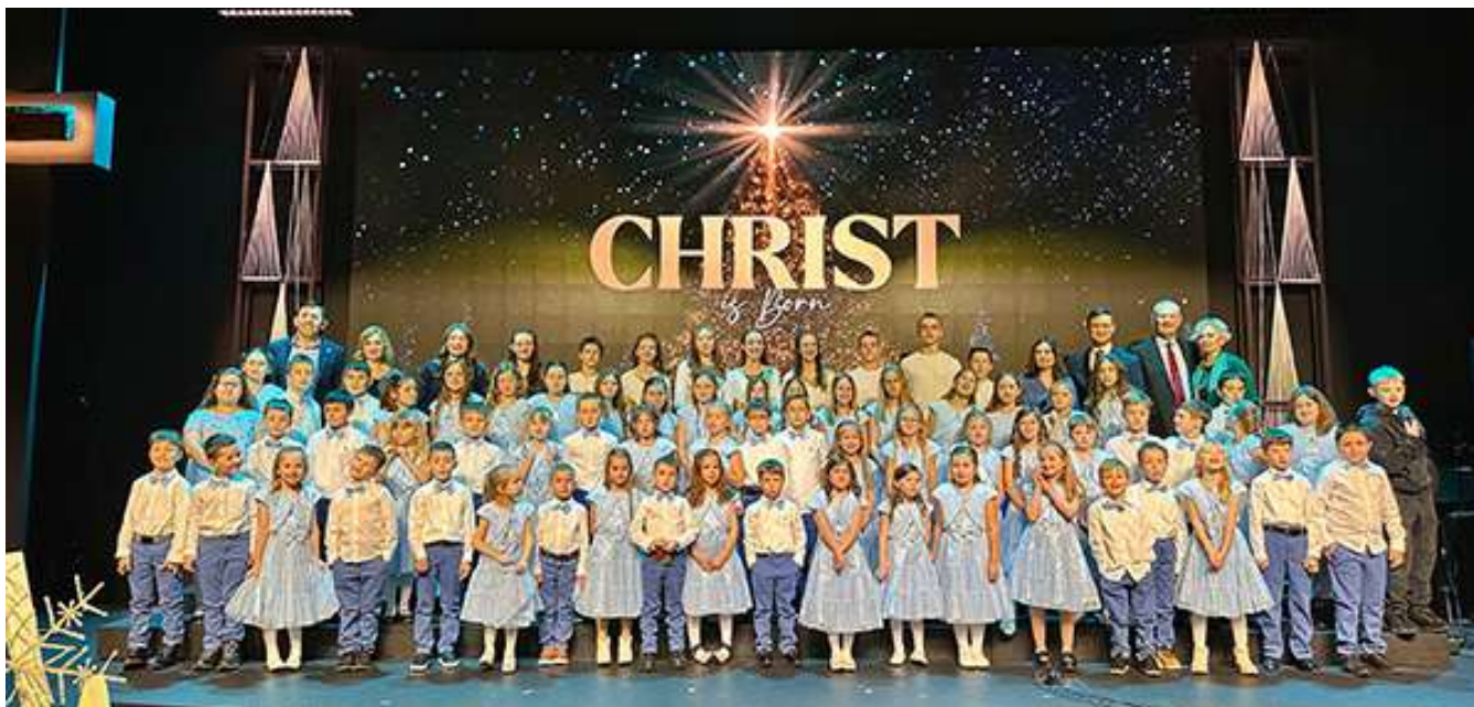
The children's choir brightened up the church service