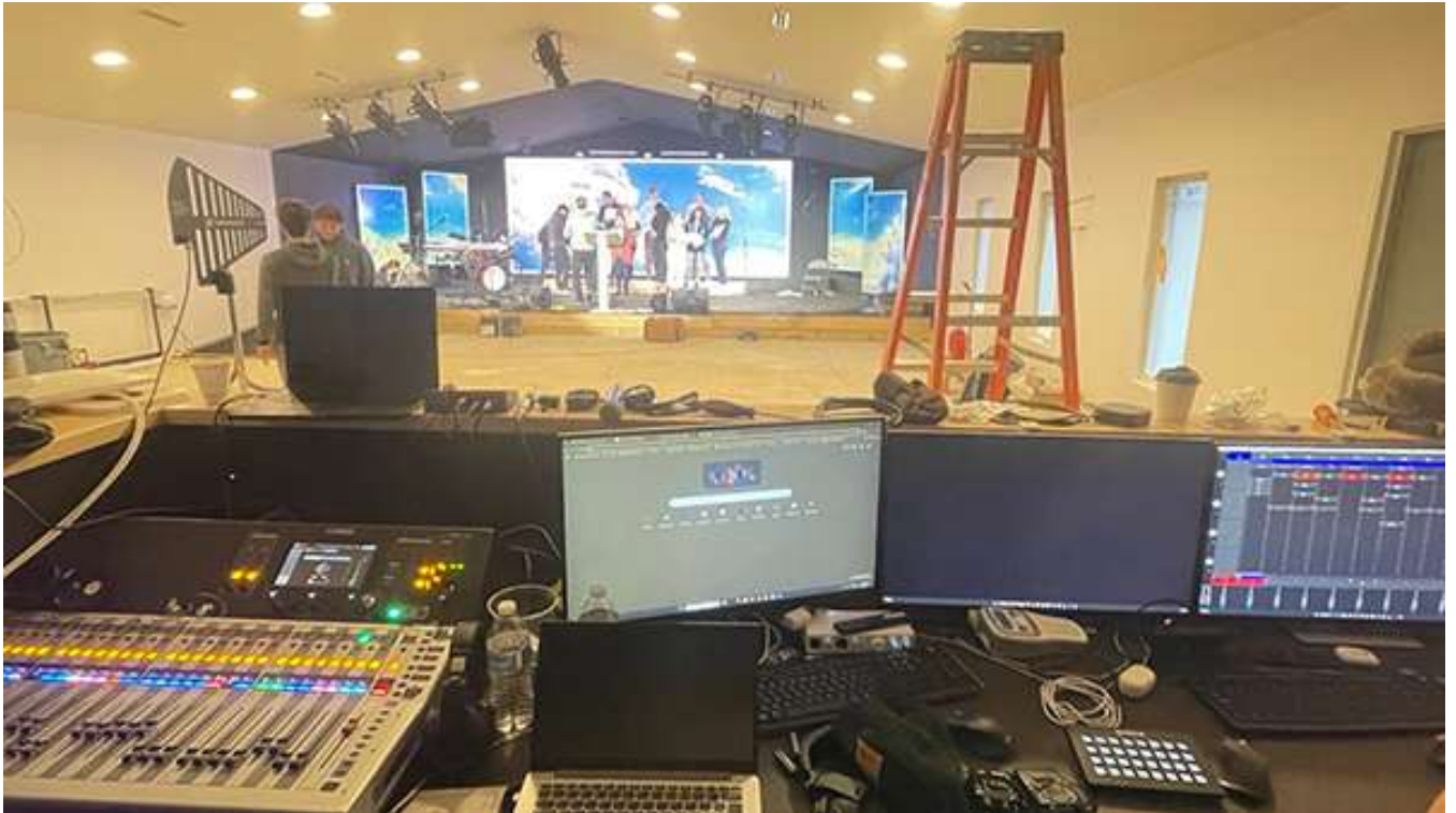
During the renovation process