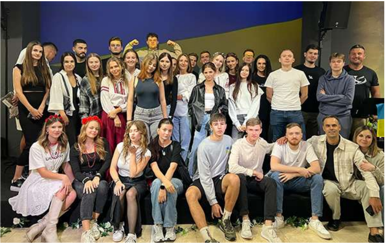
Participants of an evangelistic evening for the youth, "Ukrainian Evenings"