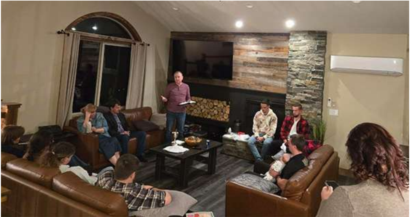
During the retreat

the spiritual growth of the youth, and spreading the ministry vision to others. More details...(in Russian only).