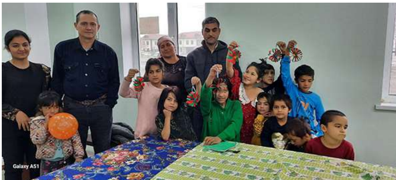
Some of the gypsy children after the lesson, where they made Christmas ornaments for the first time in their lives. Adults from left to right: translator, pastor of the local church, gypsy wife and husband.

In August of the current year, the Missionary Department and Grace Family Church organized two children's camps in Uzbekistan: in Bukhara and Syrdarya. While reading about how it went , many people were asking the question: "What's next? Will there be follow up on the work that has been done?" As it turns out, God clearly showed that He cares for the gypsies and the Uzbeks, and that He loves and takes care of them, just as he does other peoples. Read the continuation of their story at this link (in Russian only).