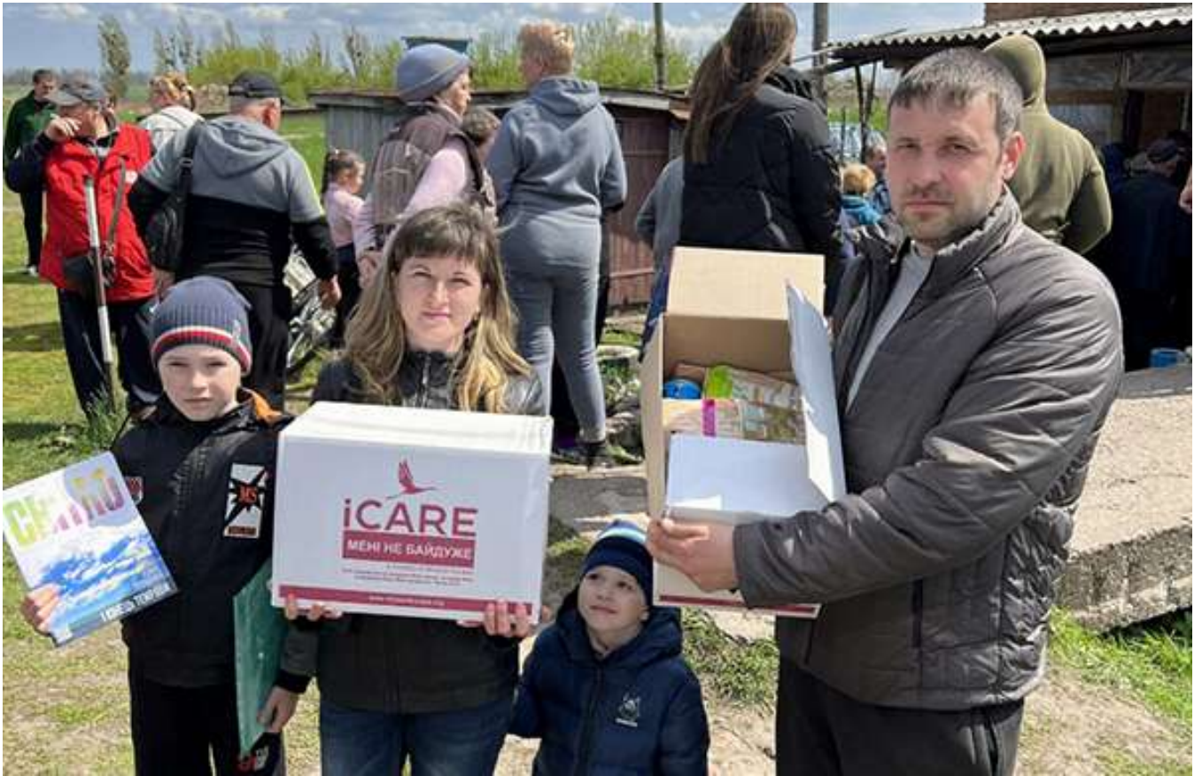
At the time of one of the aid distributions in Ukraine