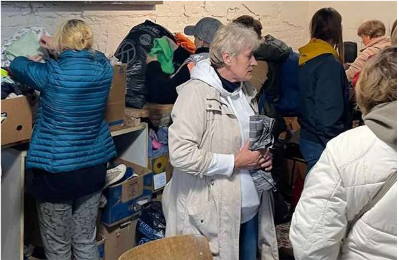
Giving out humanitarian aid in Lviv, Ukraine