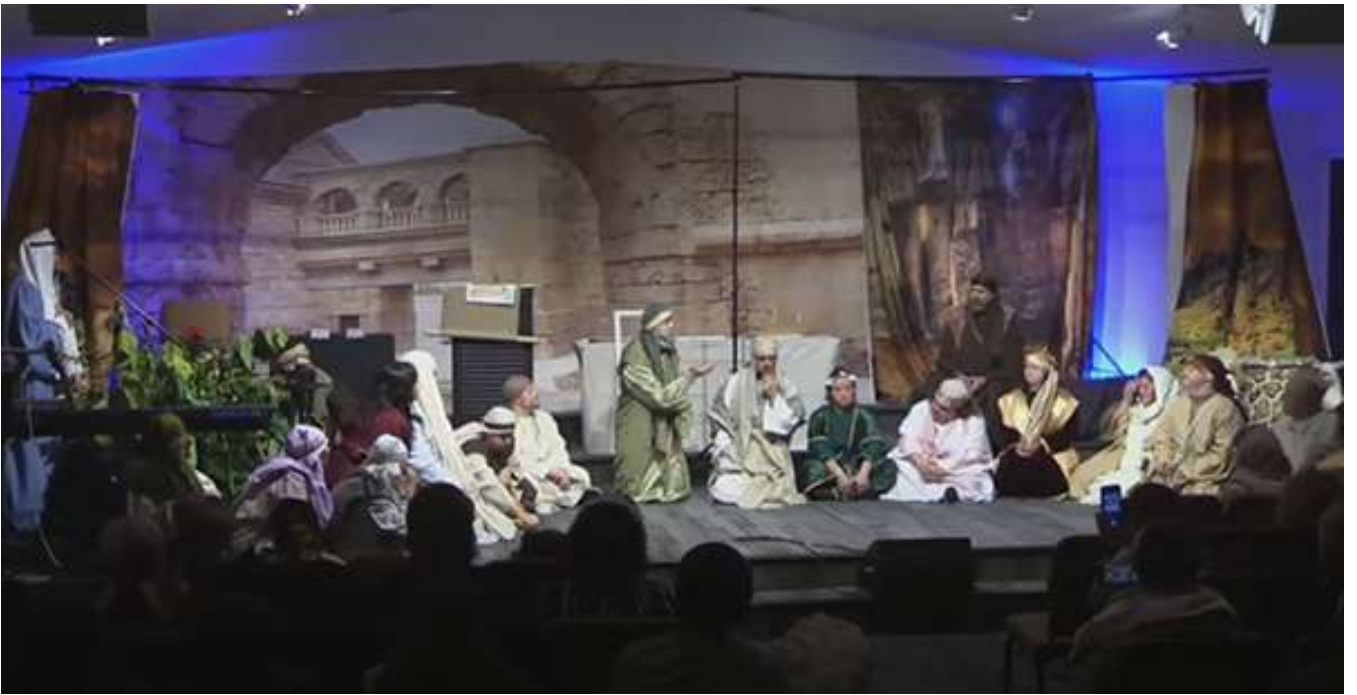
Scene from the skit