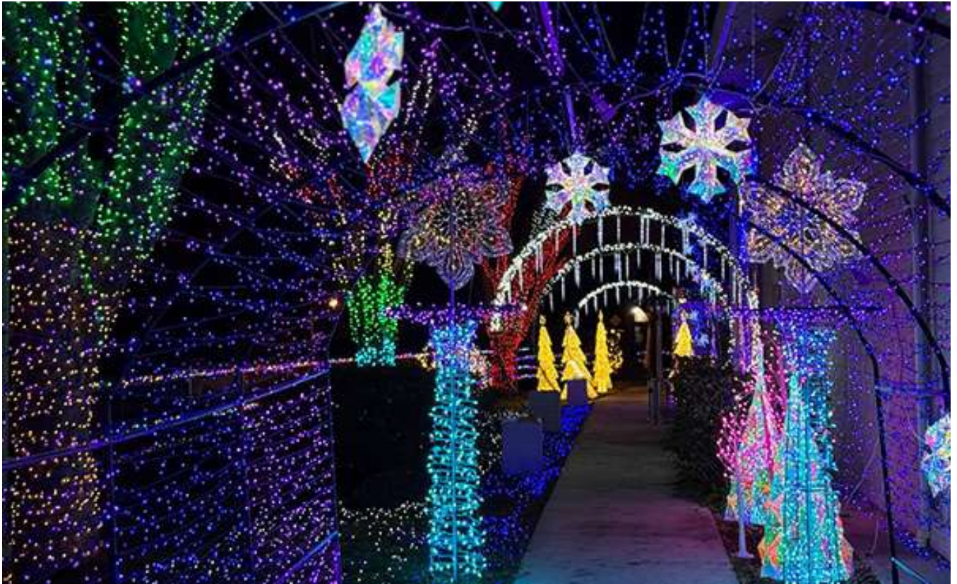
Christmas lights – truly magical!

thanks to the birth, death, and resurrection of Jesus Christ. More details are available in an article by Y. Zakharnev (in Russian only).