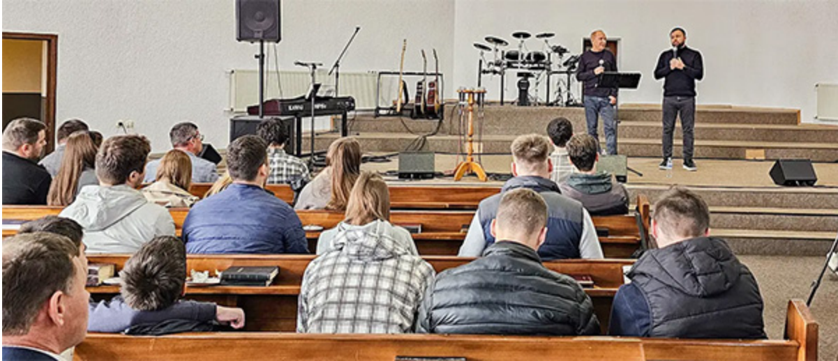
During the conference...

very first conference for those who are serving in the information ministry. The conference had 80 representatives from various regions of the country who are engaged in marketing the churches online through social media, websites, chatrooms, video channels, as well as those who assist in live streaming the church services. Click this link for more about the conference – “Church and Social Media – new challenges and new opportunities”... (in Russian only).