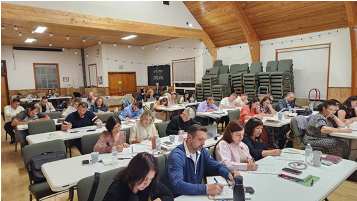
Over thirty people continue to study under the “Coram Deo” program