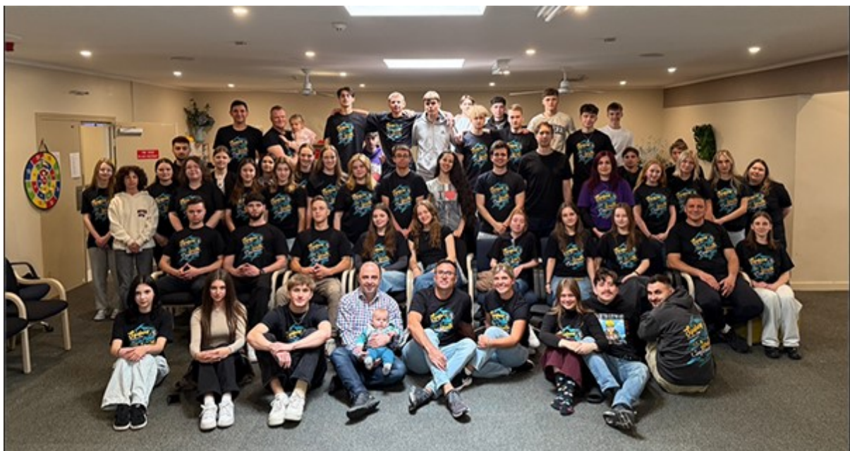
Participants of the first youth camp in Australia