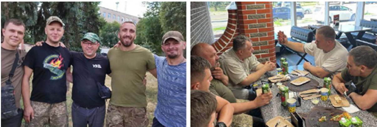
Preaching the Gospel to those in the military

Despite some very difficult circumstances related to the war, the Hope to the People ministry in Ukraine, along with many other churches, ministries, and individual people, both locally and abroad, are able to continue their evangelistic ministry. They preach the Gospel to children, teenagers, and adults through sports, camps, and various events. For more about the results of their ministry, read their ministry's newsletter – click this link (in Russian only).