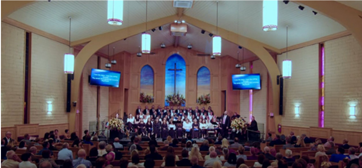
Festive church service

over during the third wave of immigration. The church members and many guests expressed their gratitude to the Lord for the blessings and challenges, trials and concerns, joys and sorrows that the Lord led them through during this entire time. More details... (in Russian only).