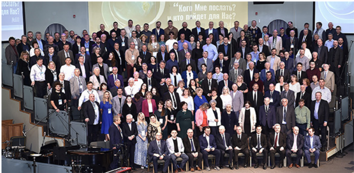
Photo of the convention delegates and the leadership of the Association