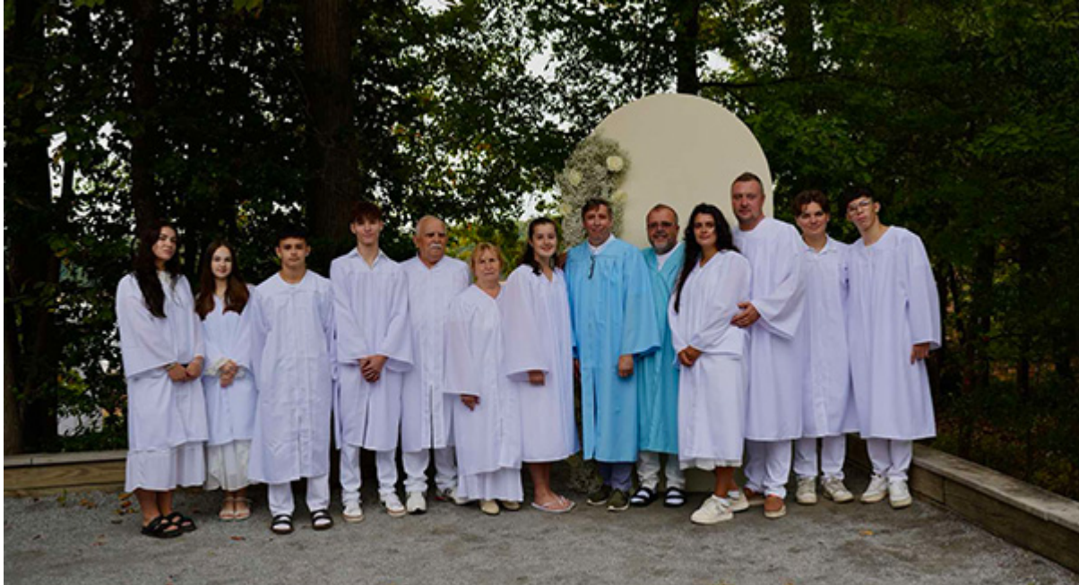
Eleven newly saved souls, new church members

On September 14, the churches of South Carolina experienced a wonderful event that affected two of the local Spring of Life Churches in Greenville and Anderson. They had a water baptism service for eleven people who publicly professed their faith in Jesus Christ and declared Him to be their personal Lord and Savior. More details... (in Russian only).