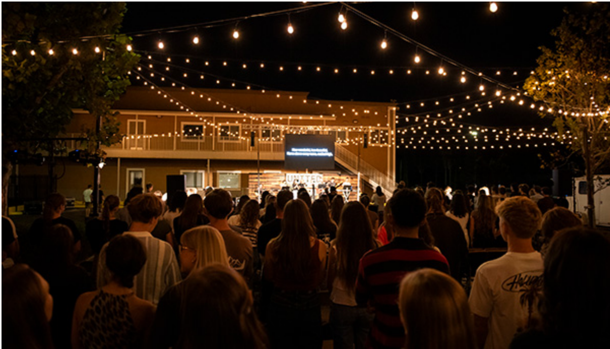
During the Worship Night