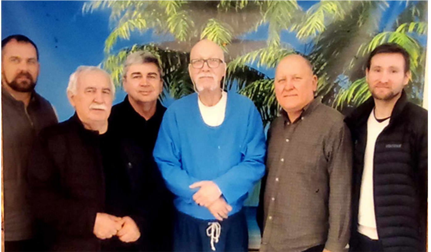
During one of the visits...